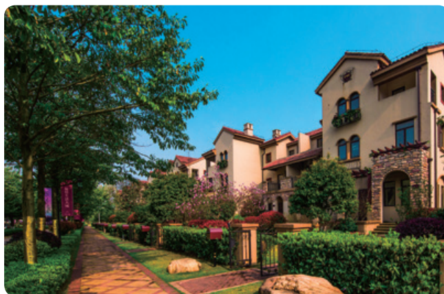
Changsha Project – Outlets Town 長沙項目－奧萊小鎮

長沙項目佔地1,500畝，由住宅部分「奧萊小鎮」及商業部分「環球奧萊」共同構成。「奧萊小鎮」是一個精心打造、洋溢西班牙風情的低密度高級住宅區。周邊環境綠茵環抱，身處小橋流水之間，住戶可享受由超低容積率帶來的休閒氣氛。小區綠化及園林環境，更是項目為之驕傲的亮點，40%的綠化率讓清新空氣唾手可得。「環球奧萊」目前已開發近10萬平方米，以極具歐美國風情的街區式購物體驗，融合園林綠化與自然風光相結合的闊景綠化公園，配合精選的國內、國際品牌組合，成為當地極受歡迎的旅遊景點。