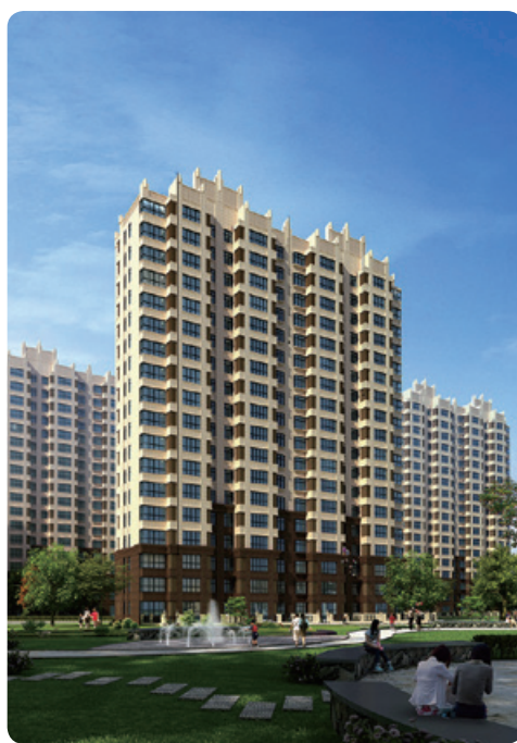
Yinchuan Project 銀川項目

銀川項目包括總地盤面積約為13.33萬平方米之五幅地塊及其上正在興建之住宅及商業綜合體，當中住宅項目金盛閱景佔地面積約為120畝，規劃建築面積22.1萬平方米。依傍周邊銀行、醫療、教育、商超、娛樂餐飲等各類資源及自身家居建材商業配套，輕鬆享受便利生活。而商業項目部分由三棟商業樓宇及兩座連廊組成，總建築面積約為9.5萬平方米，招商率高達92%。各樓棟分別經營高端建材、尚品傢俱及紅木品類，主打建材家居產品。