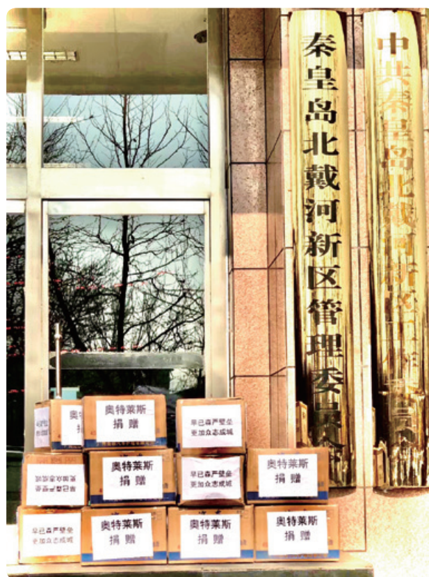
Visiting fire officers and soldiers 慰問消防官兵活動

我們時刻希望回饋社會，對於扶助社區不遺餘力，我們主要透過鼓勵員工參與社區活動，為社會的和諧和可持續發展作出貢獻。在報告期間，我們組織了慰問消防官兵活動，並且在新冠肺炎疫情期間，透過捐款、義工及捐贈蔬菜等物資，為社區抗疫出一分綿力。展望未來，我們將持續參與社區活動，表達對社區的關懷、改善社會。