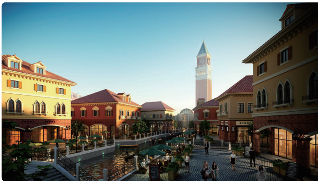
Qinhuangdao Project 秦皇島項目

秦皇島項目是一個以奧特萊斯商業為主導，集高端溫泉度假酒店、高端醫院、養生養老、文化娛樂、休閒度假為一體的大型沿海購物旅遊康養度假綜合體。項目佔地約1,077畝，計劃分三期開發。其中，項目一期總用地面積近23萬平方米，包括奧萊商業、養生酒店、度假用房及展示中心，同時配套停車場及綠化景觀打造。於報告期間我們繼續重點開發項目一期。