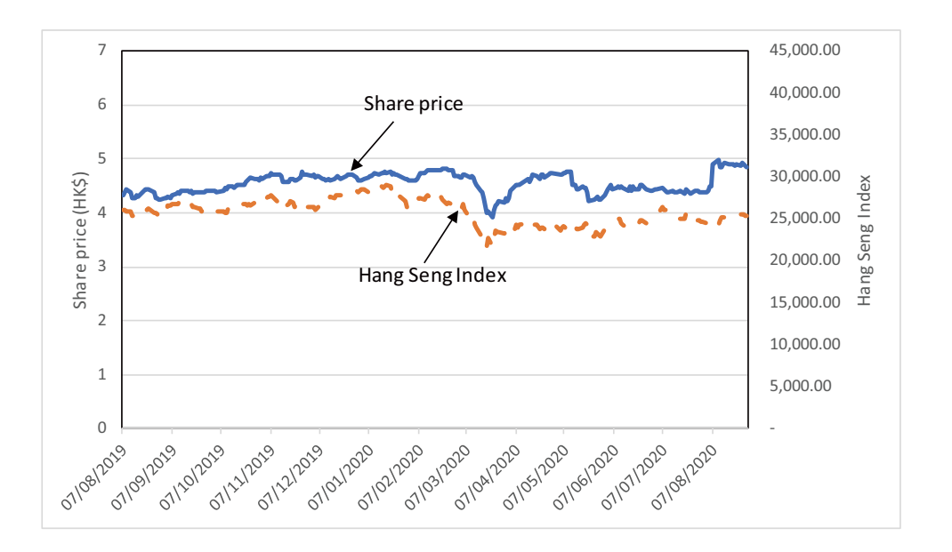
FIGURE 2: COMPARISON OF SHARE PRICE PERFORMANCE WITH HANG SENG INDEX ("HSI")