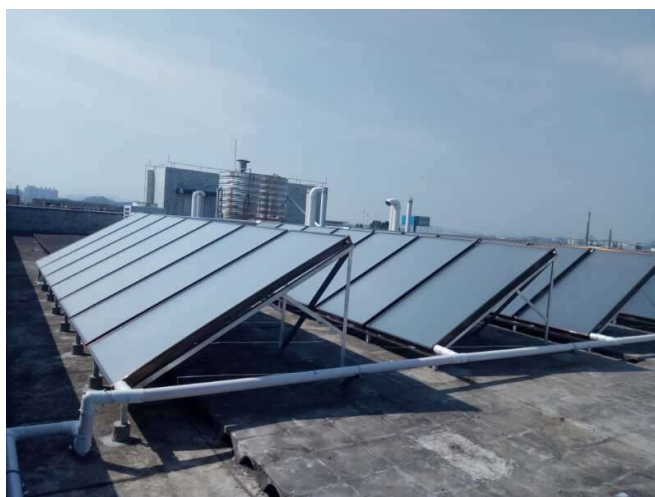
Jiangmen Factory – solar heating system