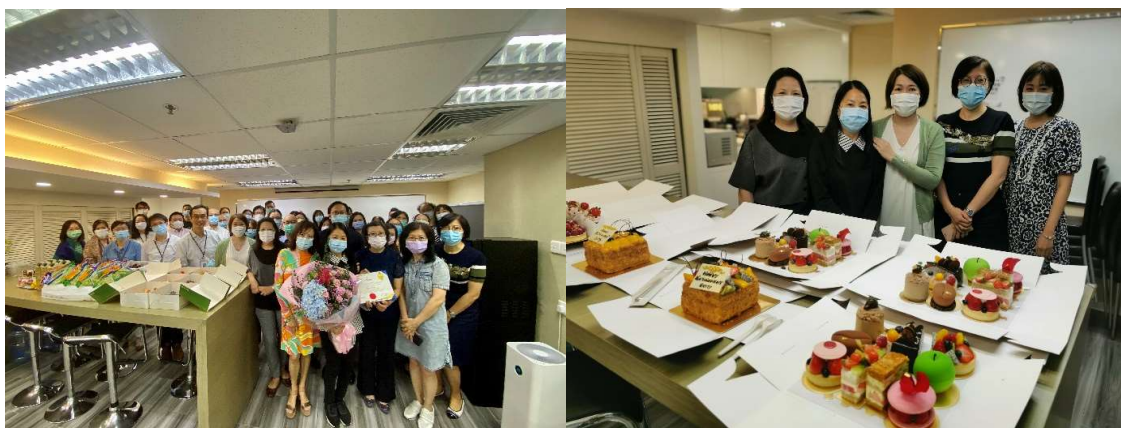
Farwell Party for Retired Staff