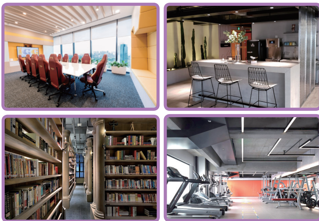
Comfortable Office Environment

and all employees, service staff and security personnel were provided with personal infection protective products. Measures such as sitting separately during meals, using video conference, going paperless, reducing travelling, and tightening visitor and vehicle controls, were also part of the steps to create a safe workplace for all employees. The epidemic has not caused any material and adverse impacts to the Group's operation so far and its business operation has remained normal. At the beginning of 2021, the Group gave each of its more than 2,000 employees worldwide a US$800 incentive payment and a gift package of protective equipment, to thank employees around the world for their contribution to keep the Group's operation uninterrupted in 2020 and to encourage them to continue playing a part to fight the pandemic.