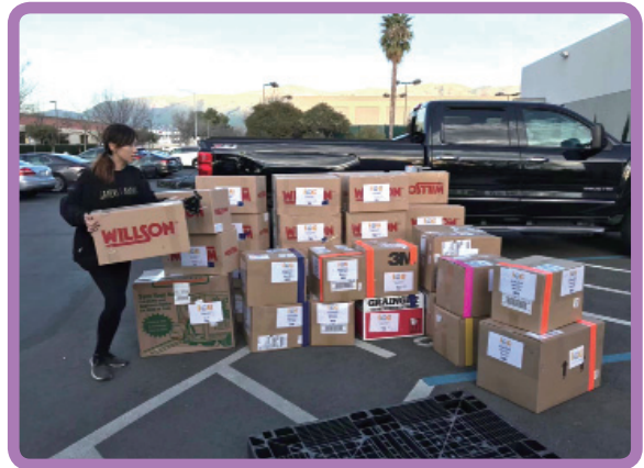
Preparing Medical Supplies for Donations