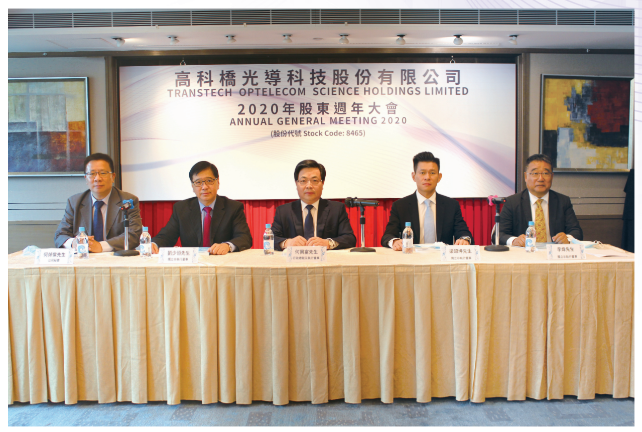
* The third annual general meeting after Listing was held on 28 May 2020