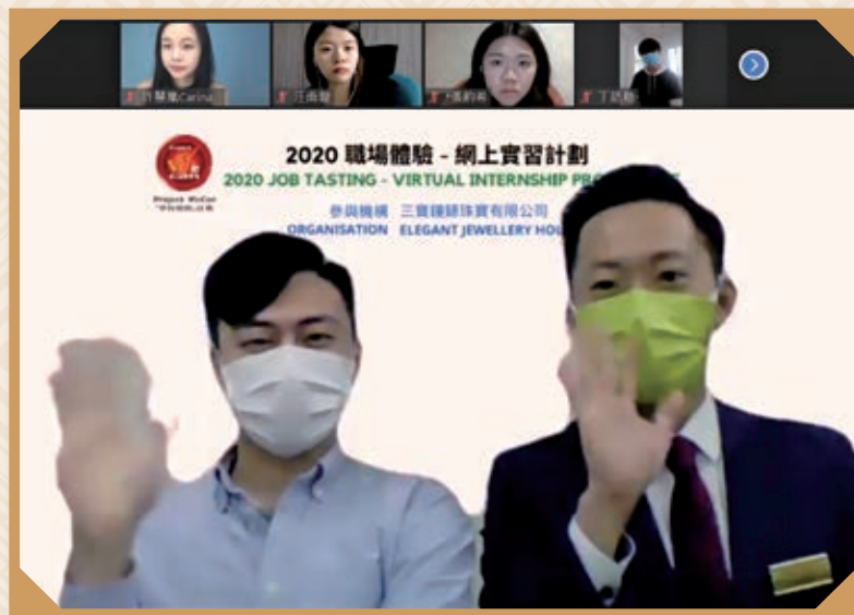
The Group held two introduction seminars on the watch retail industry for students who were about to graduate and go to society online instead.

回顧年度內，三寶公司通過「學校起動計劃」面試挑選了三位年滿16週歲的學生，原本按計劃擬定於7月暑假到集團零售門店開展為期兩週的門店實習，學習招待客人、零售買賣等日常前線工作，為即將畢業的學生提供真實的職場環境，助其更好地走向社會。因為疫情的關係，實習活動被迫取消，最終改為於8月中以網絡形式舉辦了兩場鐘錶零售行業簡介講座，令參與的學生對鐘錶零售行業的日常運營及工作範疇有了大致的了解。