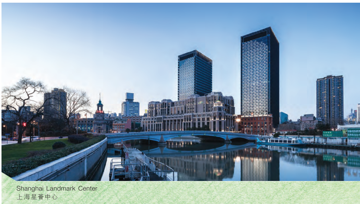
Shanghai Landmark Center 上海星薈中心