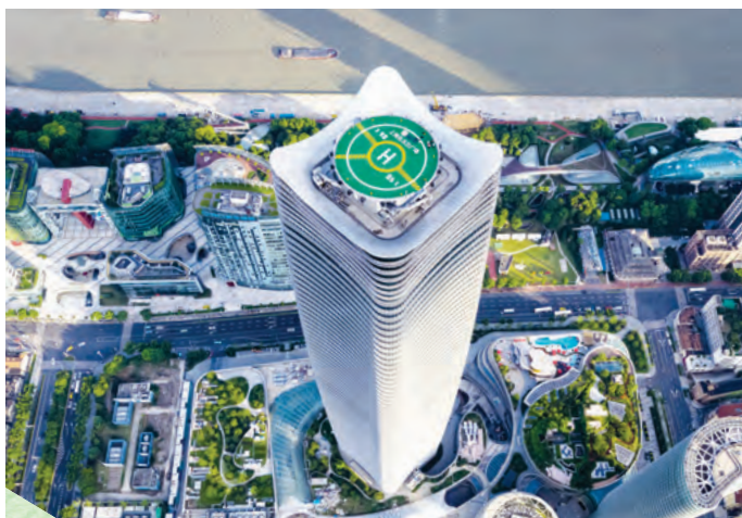
Shanghai Sinar Mas Plaza 上海白玉蘭廣場

第一季過後經濟復甦帶動住宅物業銷售，令整體收入錄得增長14%。住宅物業之已確認銷售較去年上升29%至644,500,000港元，惟商用物業的租賃收入則下跌7%。毛利下跌3%至662,200,000港元。本集團不但沒有二零一九年所錄得的投資物業重估收益91,900,000港元，反而錄得投資物業重估虧損98,400,000港元。因此，本集團之盈利下跌36%至241,600,000港元。