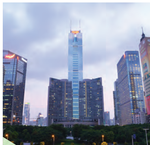
Guangzhou CITIC Plaza 廣州中信廣場