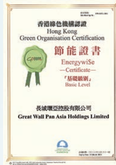
Energywise Certificate (Basic Level) 「節能證書 (基礎級別)」