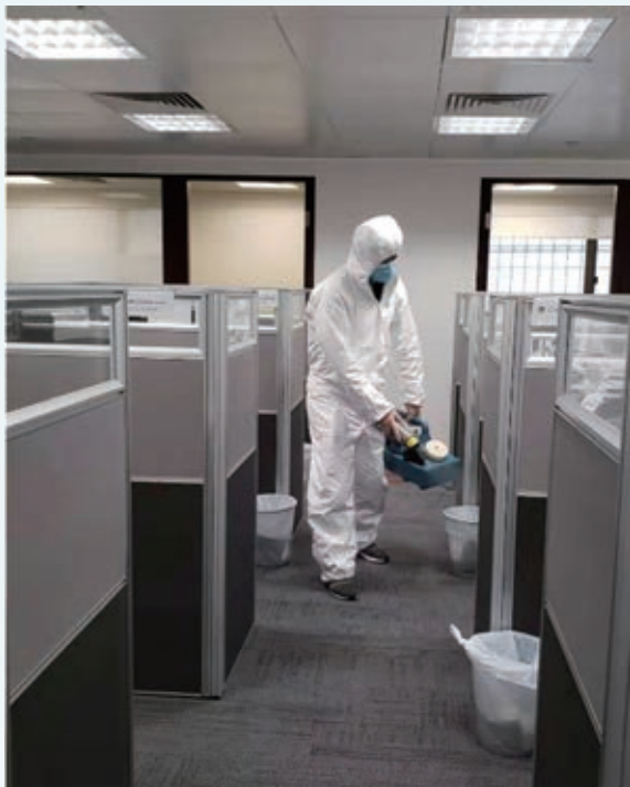
In-depth disinfection and cleaning service provided by professional disinfection company 專業消毒公司提供辦公室深度消毒清潔服務