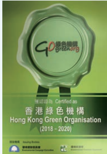
Hong Kong Green Organisation Certificate 「香港綠色機構」證書