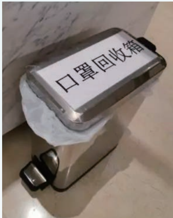
Recycling bin for masks 口罩專用回收箱