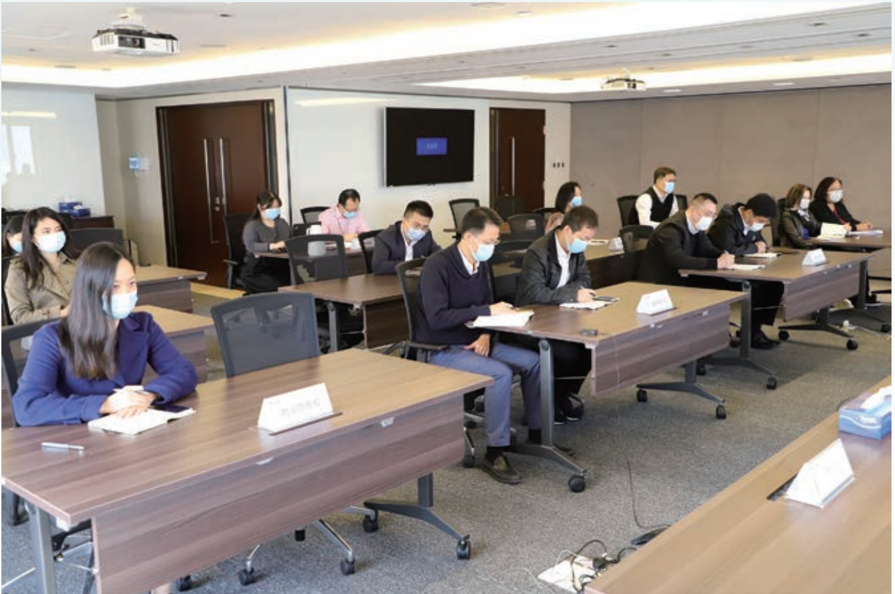
Employees attending trainings in 2020 員工於二零二零年參與培訓

每次培訓結束後，本公司向員工收集培訓的評價調查問卷，針對培訓的有效性，包括培訓安排、培訓內容及講師表現評估等，再作出相應的調整，以滿足員工的培訓要求。同時，所有培訓材料都上傳到本公司的共享文件夾中，以便所有員工都能夠輕鬆獲取，以構建知識共享的文化。人力資源部亦會收集參與者名單，以確保符合證監會對於持續記錄培訓時數的要求。