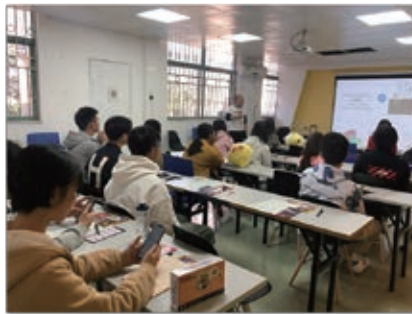
校園招聘會 On-campus Job Fair