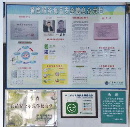
Food safety information bulletin board in school canteens