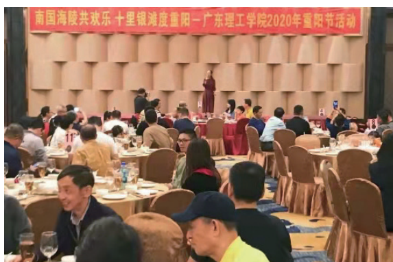
Staff "Chung Yeung Festival" activities