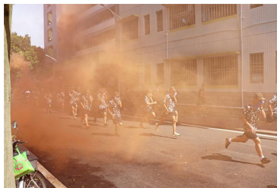
School Fire Drill