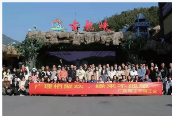
Staff social activities