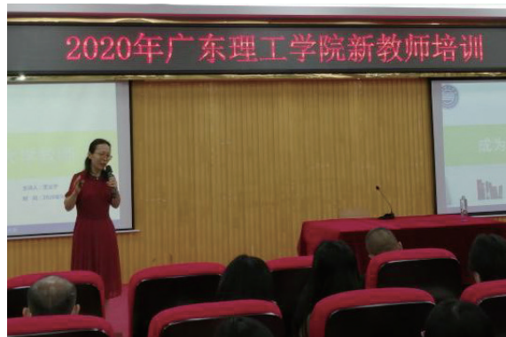
Orientation training for new teachers