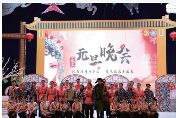
Staff New Year's Day party

The Group advocates work-life balance and strictly abide by the Labor Law of the PRC and the Law of the PRC on the Prevention and Control of Occupational Diseases and other relevant laws and regulations, encourage staff to combine work and rest, maintain a good attitude, and teach and educate students with a positive and healthy mindset. We organize all kinds of recreational activities through trade unions on a regular basis, including concerts, sports games, dinners, traveling and outdoor activities, in order to enable employees to release pressure in spare time and increase team cohesion. During the Reporting Period, we organized a series of colorful activities for employees, such as Teachers' Day celebrations, autumn outing, employee sports games and festival celebrations.