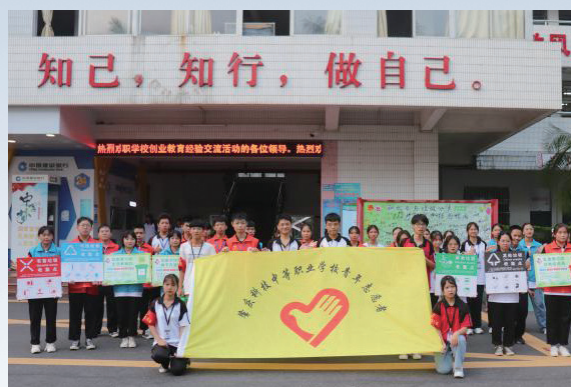
Campus garbage separation publicity event