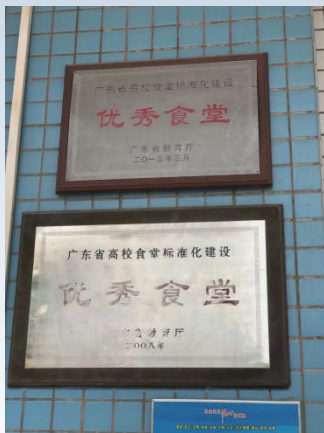
Certificate of “Excellent Canteen” awarded by Department of Education of Guangdong Province

To further ensure the hygiene of the canteens, we have set out the requirements for personal hygiene of canteen employees in guidelines such as the Health Management System for employees. All canteen employees must undergo health checkups, attend training on food safety knowledge and pass the relevant examinations before taking up the positions. We have also established a food safety management team and appointed full-time food safety management employees to manage food safety in schools in a more systematic way.