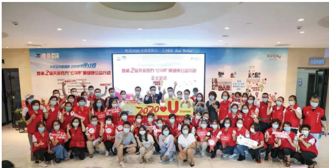
關愛紅馬甲健康活動Free eye check-up in Shenzhen

為了履行社會責任，本集團向香港公益金，亮睛工程慈善基金有限公司和西醫工會捐款總計超過343,000港元，以支持他們對社區的工作。