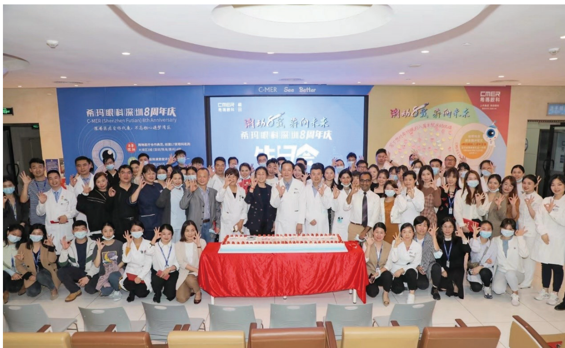
深圳希瑪眼科醫院8周年慶 Shenzhen C-MER Eye Hospital Eighth Year Anniversary

本集團安排各種內部員工活動以作鬆弛及建立團隊精神，並答謝僱員辛勤工作及加強跨部門團隊合作。活動包括年度晚宴及各種團建活動。透過該等活動，不同部門的僱員有所互動，營造士氣高昂的工作氣氛，有利工作生活平衡及提升生產力。