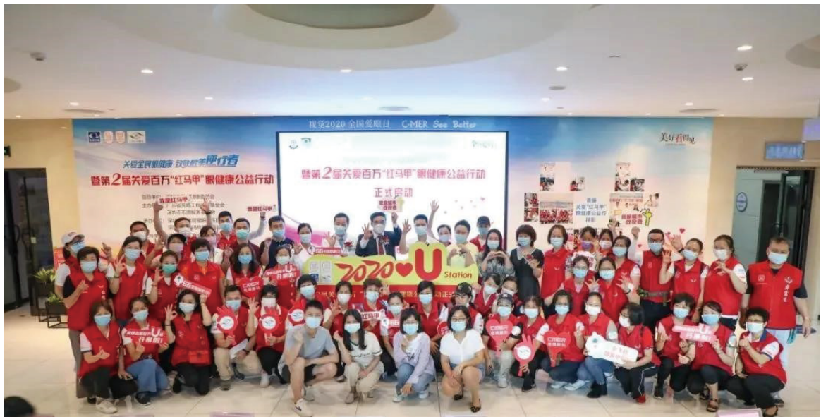
關愛紅馬甲健康活動Free eye check-up in Shenzhen

為了履行社會責任，本集團向香港公益金，亮睛工程慈善基金有限公司和西醫工會捐款總計超過343,000港元，以支持他們對社區的工作。