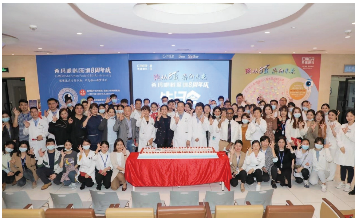
深圳希瑪眼科醫院8周年慶 Shenzhen C-MER Eye Hospital Eighth Year Anniversary

本集團安排各種內部員工活動以作鬆弛及建立團隊精神，並答謝僱員辛勤工作及加強跨部門團隊合作。活動包括年度晚宴及各種團建活動。透過該等活動，不同部門的僱員有所互動，營造士氣高昂的工作氣氛，有利工作生活平衡及提升生產力。