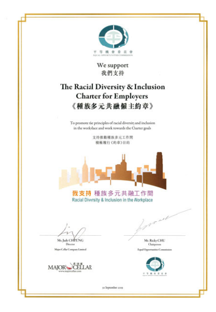
Certification of The Racial Diversity & Inclusion Charter for Employers

The Group's equal opportunities code specified under the Staff Handbook allows zero tolerance to any workplace discrimination, harassment or victimization in accordance to relevant government legislation, ordinances and regulations. Employees are encouraged to report any incidents involving discrimination to the Audit Committee of the Board of the Group. We strive to ensure that complaints, grievances and concerns, including whistle blowing, are dealt in a prompt and confidential manner.