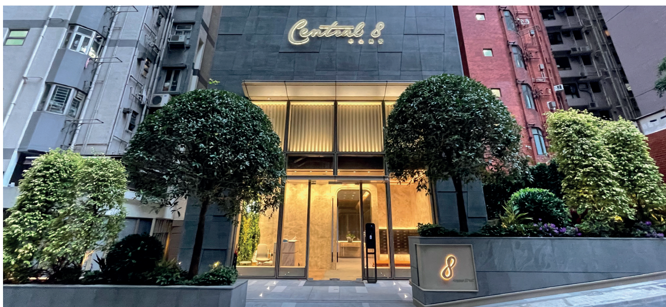
Central 8 半山捌號

毛利減少至647,300,000港元（2020年：1,506,700,000港元）。隨著本集團的投資物業重估減值大幅減少至1,210,600,000港元（2020年：4,129,500,000港元），本公司擁有人應佔本年度虧損減少至767,400,000港元（2020年：3,644,400,000港元）。每股基本虧損為0.21港元（2020年：0.99港元）。董事會建議派付末期股息每股0.012港元（2020年：0.035港元）。連同中期股息每股0.012港元（2020年：0.035港元），本年度股息總額為每股0.024港元（2020年：0.070港元）。