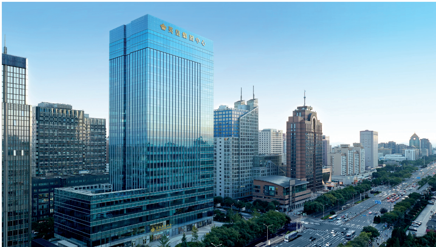
Emperor Group Centre Beijing 北京英皇集團中心

就房地產開發市場而言，隨著香港疫情開始穩定，買家的信心開始增強。於低利率環境及相對具抗跌力的市場需求下，房地產開發商逐漸恢復銷售。