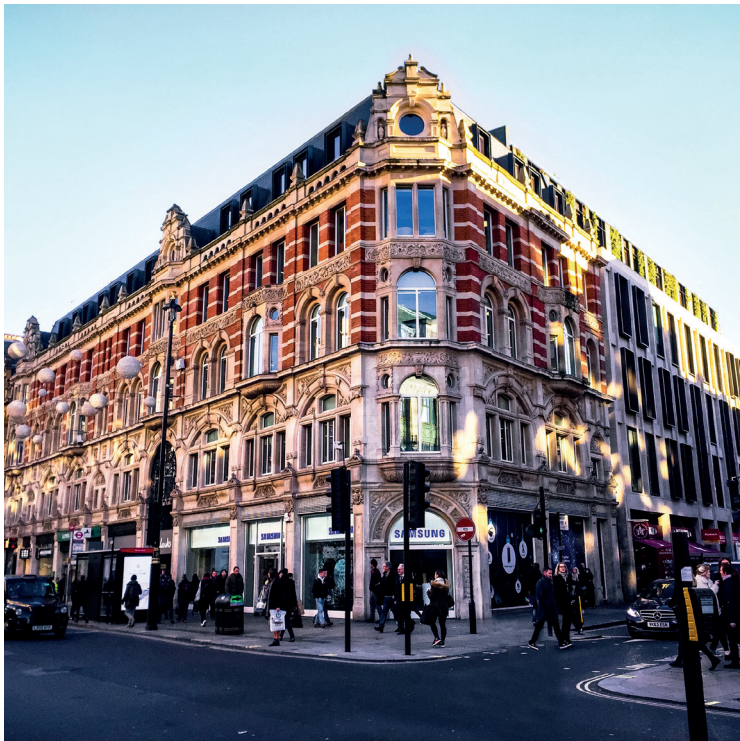
Ampersand Building, London 倫敦Ampersand大廈

位於 牛津街27號 的重建項目已於2021年初完成。該地盤佔據倫敦重要的商業及購物位置，備受國際旅客的青睞，已重建為一幢總樓面面積約19,000平方呎、樓高9層的零售及辦公綜合大樓。該項目需保留大廈歷史悠久的外牆。