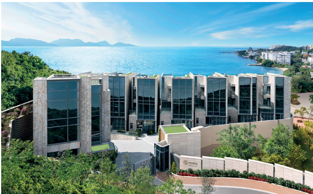
Seaside Castle 畔海

畔海 為位於屯門大欖澄麗路9號之黃金住宅項目，其包括8幢獨立海景豪華洋房，總樓面面積約29,000平方呎。該用地毗鄰深港西部通道及港珠澳大橋等新交通基礎設施，方便來往大灣區的城市。該項目亦鄰近著名的哈羅國際學校。該項目已於本年度完工，並已於本年度後推出市場。