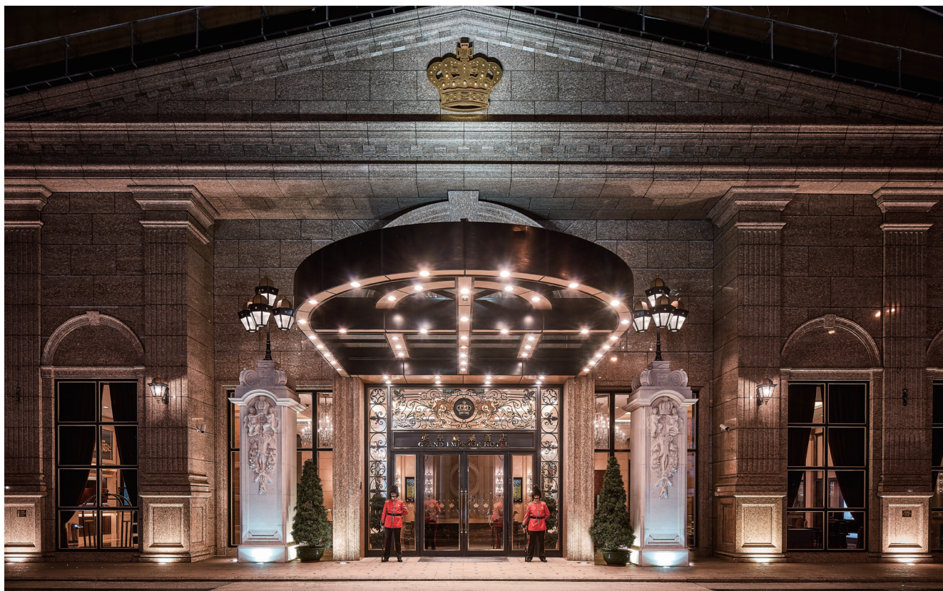
Grand Emperor Hotel 英皇娛樂酒店

於本年度後，位於香港之一間酒店及兩間服務式公寓（ 英皇駿景酒店 、 The Unit服務式公寓 及 MORI MORI服務式公寓 ）出售予本集團之附屬公司英皇娛樂酒店有限公司（「英皇娛樂酒店」；股份代號：296），代價為2,082,500,000港元。因此，整個酒店業務分部由英皇娛樂酒店直接擁有，而相關的經常性收入將繼續併入至本集團。