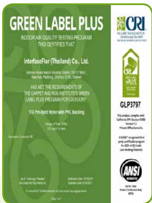
Figure 12: Green Label Plus Certificate 圖12：綠色標籤Plus認證

Due to our business nature, our core operations do not rely significantly on the suppliers. The equipment and service that we procure include market information, professional business service, computer system, legal advisors and software vendors. Our procurement process takes into account the reputation, expertise, quality, price, capacity creditability, corporate standards and more importantly, their social and environmental contribution and relevant certificates. For each area, we have several pre-approved suppliers to minimize business disruption. We strive to provide a transparent and fair supplier selection process to enhance our relationship with the suppliers.