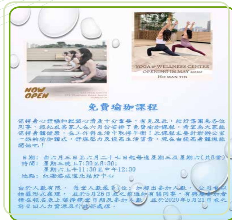
Figure 5: Yoga course poster