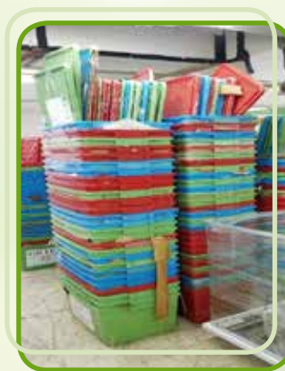
Figure 2: Reusable Plastic Boxes

我們的紙張採購程序會排列紙張供應商的優先順序，其以供應商有否獲得「森林認證體系認可計劃」認證作為基準。該認證確保我們所用紙張乃由可持續森林的桉木漿製成，旨在緩減環境惡化的速度。於辦公室裝修完成後，本集團將使用可重用膠箱，以取代紙箱。本集團致力採用不同代替方案以避免在業務營運中使用紙張。