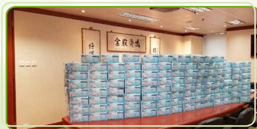
Figure 8: ASTM level 3 mask for employees and account executives