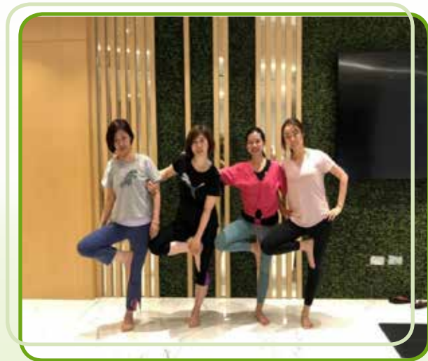
Figure 4: Staffs and account executives in yoga course 圖4：參加瑜伽課程的僱員及經紀