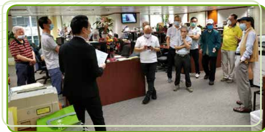
Figure 11: MPF briefing for account executive (May 2020) 圖11：為經紀簡介強積金計劃（二零二零年五月）

Students from both foreign and local universities are eligible for our internship programme. The Group organises skill-building workshop and provide on the job training dedicated to interns. Throughout the programme, they are given an opportunity to network with senior managements to obtain advices for their own career paths and to gain a deeper understanding in the financial services industry.