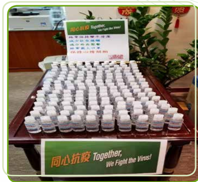
Figure 9: Hand Sanitizers for employees and account executives 圖9：向僱員及經紀派發酒精搓手液