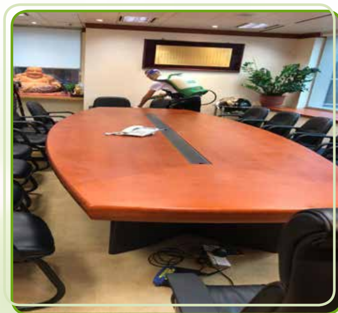
Figure 6: Arranged a self-sanitizing cleaning within the office premise (September 2020)