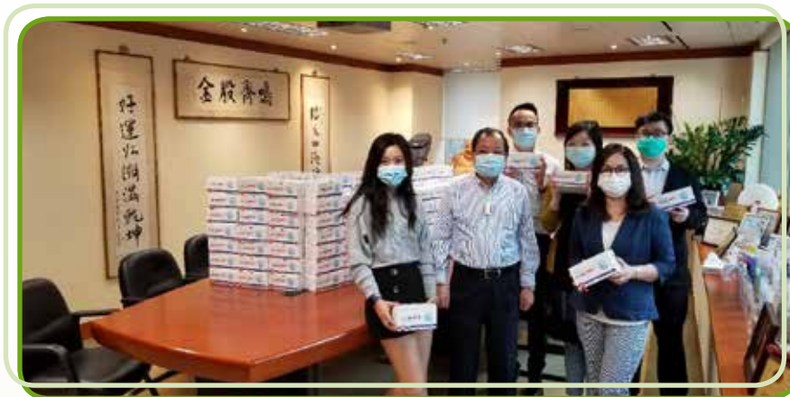
Figure 7: Mask for employees and executives

口罩及消毒用品乃預防新型冠狀病毒病的基本措施，本集團致力確保所有僱員及經紀在工作時配備該等物資，盡量減少業務受阻的機會。於二零二零年七月，本集團向每位僱員及經紀派發酒精搓手液。於二零二零年十一月及二零二一年一月，所有僱員及經紀更獲分發一盒ASTM 3級口罩，提供高效保護。