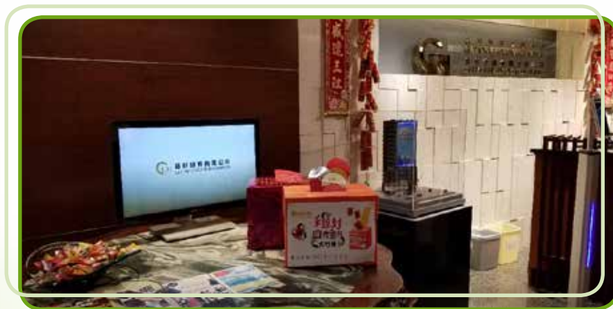
Figure 14: Lai-see donation boxes (March 2021) 圖14：利事封轉贈箱（二零二一年三月）

The Group recognizes that the well-being and stability of our community is vital for our sustainable business development. Through supporting the community, we fulfil one of our core values which is to give back to the community. The Group worked closely with Po Leung Kuk and donated HK$10,000 to further support their current initiatives. As a responsible corporate citizen, the Group has fostered the culture of community engagement and has actively participated in a range of social welfare activities. In the Lai-See Packet Recycle & Reuse Programme, the Group collected the used red packets from employees and donated it to charity organizations.