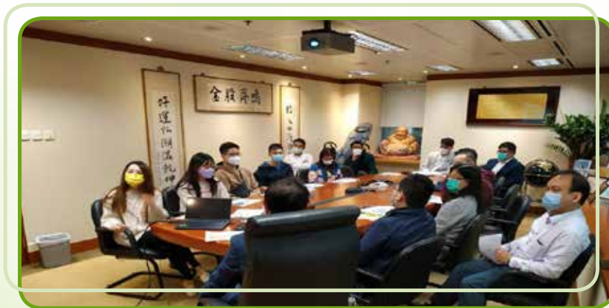
Figure 10: Training courses for new account executives (December 2020)

人才乃本集團取得競爭優勢的核心所在，我們認可並尊重員工的個人價值。本集團持續改良其精心開發的培訓平台，支持僱員的個人發展，從而發揮最大潛能。我們的平台為僱員提供內部及外部培訓課程，傳授最新的行業知識。我們為新加入的經紀設立培訓課程，確保經紀掌握必備技能以持續提供高質服務。我們更為僱員安排特設課程，助其考取與職位相關的資格。該等課程為持續專業培訓，將一直保持、發展並鞏固僱員在職業生涯中所需的專業知識及個人技能，以確保員工保持個人競爭力，並在其職業發展中不斷學習新技能。