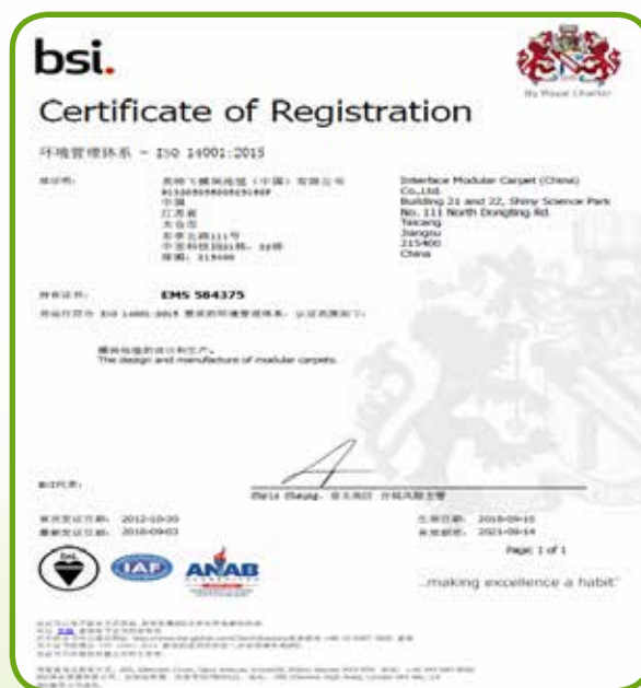
Figure 13: Modular carpet Certificate 圖13：模塊地毯認證

由於我們的業務性質，我們的核心業務對供應商的依賴性不大。我們採購的設備及服務包括市場資訊、專業商業服務、電腦系統、法律顧問及軟件供應商。我們的採購過程考慮到聲譽、專業知識、品質、價格、能力信譽、企業標準，更重要的是考慮到其社會及環境貢獻以及相關證書。我們在各領域均有數個預先批核的供應商，以盡量減少業務受阻情況。我們致力提供透明和公平的供應商甄選過程，以加強我們與供應商的關係。