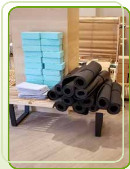
Figure 3: Yoga equipment 圖3：瑜伽設備

We believe that exercise is equally as important as healthy eating. Between June and August, the Group also offered free yoga courses for the employees and account executives which abides to the COVID-19 safety measures.