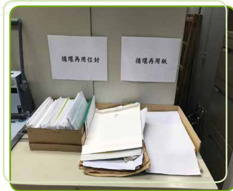
Figure 1: Reusable paper and letter tray 圖1：收集可重用紙張及信封的回收盤

Furthermore, we also work with other stakeholders including customers and shareholders to reduce the paper consumption level. We encourage customer to opt in for paperless billings. In this Reporting Period, around 80% of GNS's new customers selected paperless billings while 48% of GNS existing customers selected paperless billings. Compared with previous year, more existing customers has opted in for paperless billing.