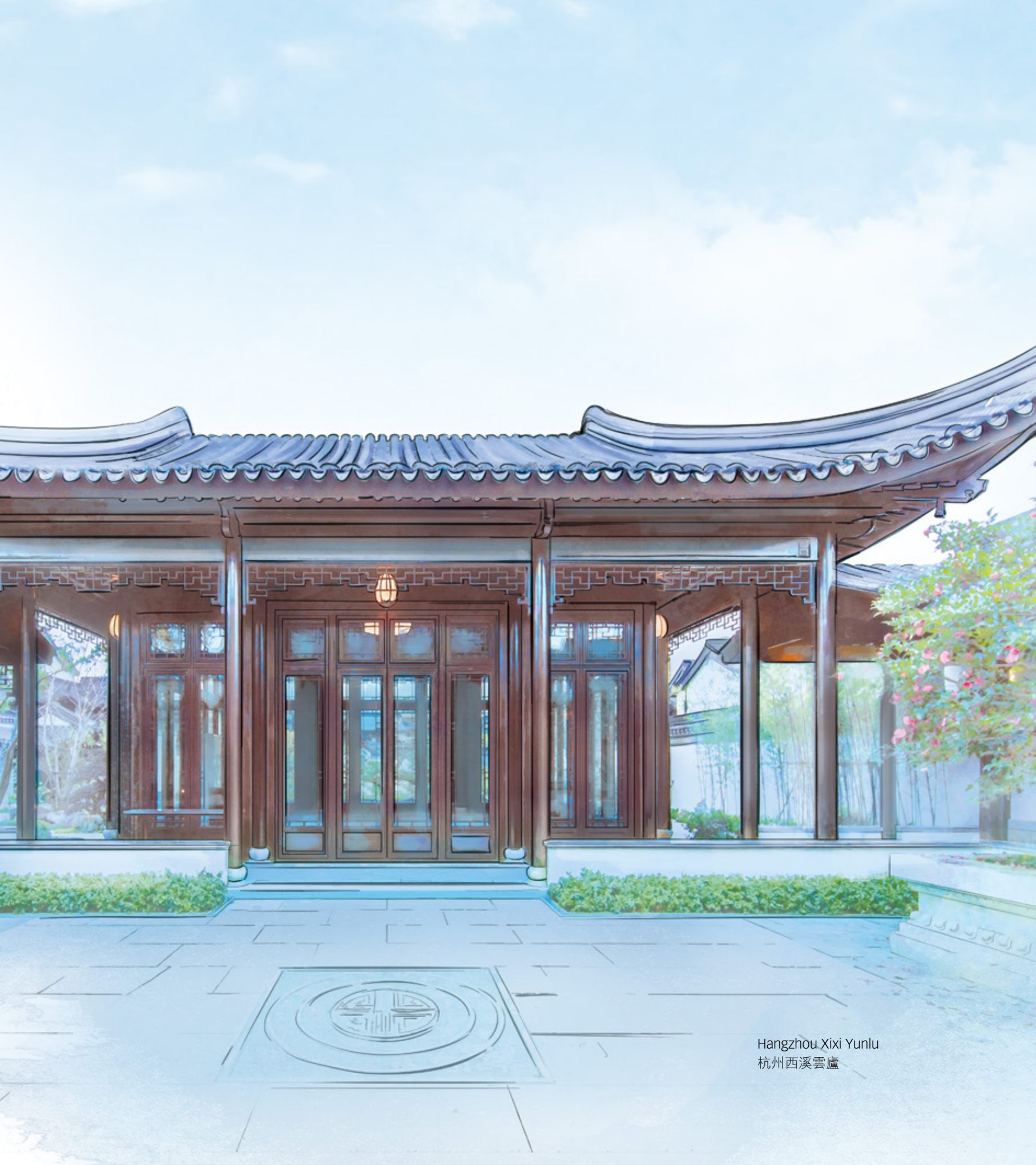
Hangzhou Xixi Yunlu 杭州西溪雲廬