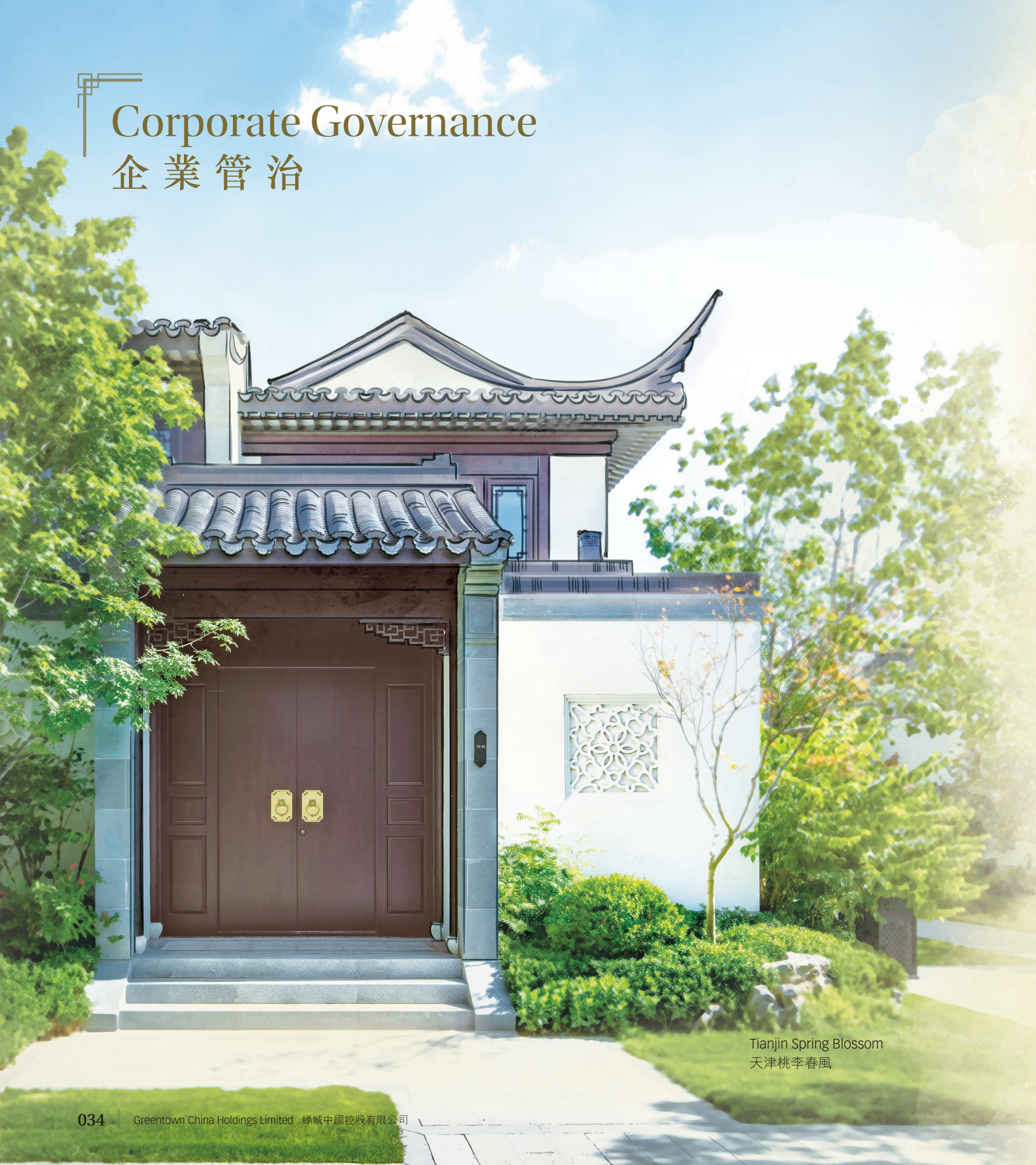
Tianjin Spring Blossom 天津桃李春風