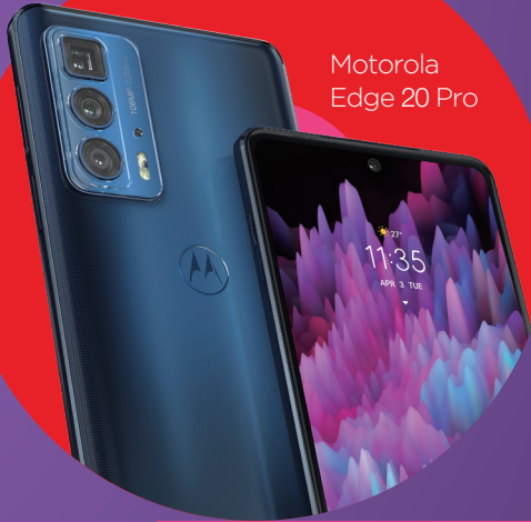
Motorola Edge 20 Pro