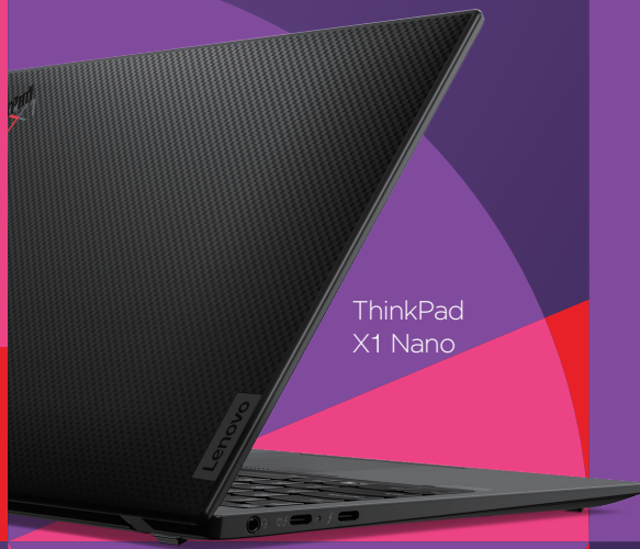
ThinkPad X1 Nano