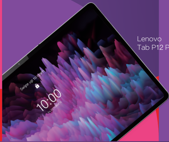
Lenovo Tab P12 Pro