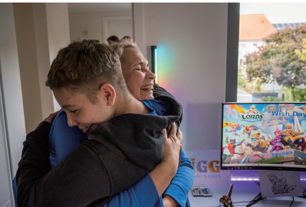
"Lords Mobile" granting wishes for children in need