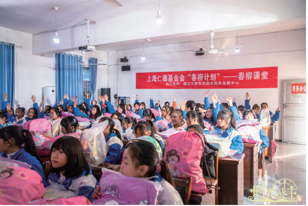
"Time Princess" empowering underprivileged girls