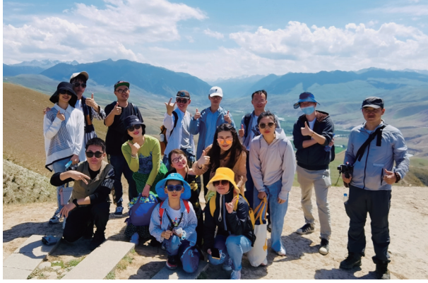
Staff Retreat and Holiday Events