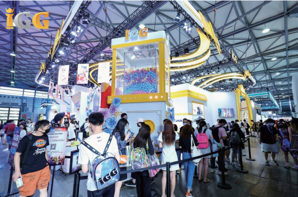
Player Interactive Events