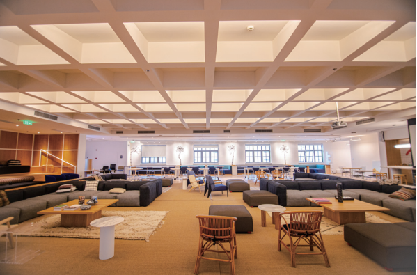
Comfortable Office Environment