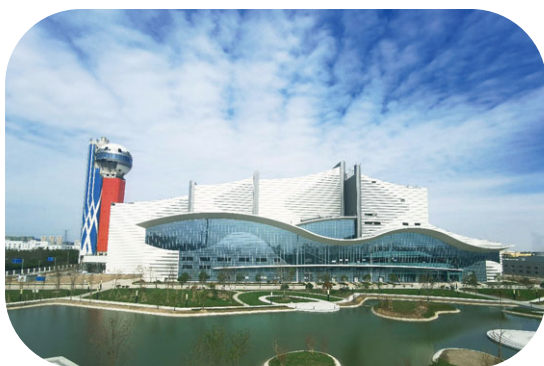
Haining Expansion Project

This report covers the information of Dynagreen Environmental Protection Group Co., Ltd. and its subsidiaries and focuses on reporting the environmental and social performances relating to the waste treatment projects of the Group in China during the reporting period. The environmental information disclosed in the Report covers the Group's head office and 24 projects which are key pollution monitoring companies that were in operation throughout 2021 (located in Changzhou, Haining, Pingyang, Yongjia, Wuhan, Taizhou, Rushan, Anshun, Jizhou, Huizhou, Jurong, Bengbu, Tongzhou, Ninghe, Guangyuan, Miyun, Jiamusi, Shantou, Bobai, Zhangqiu, Sihui, Hong'an, Yichun and Fengcheng, respectively).