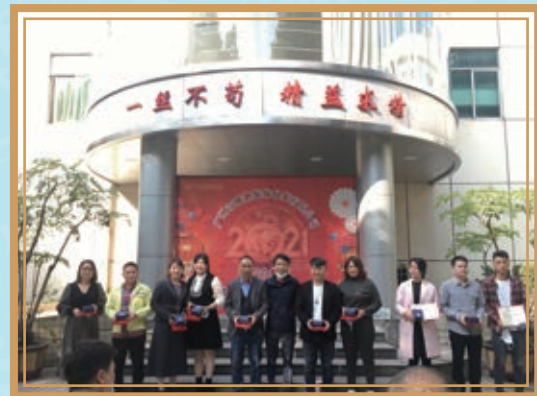
The Group's subsidiary, Guangzhou Artdeco, presented awards to outstanding employees of last year 集團下屬廣州雅迪公司為上年度優秀員工頒獎