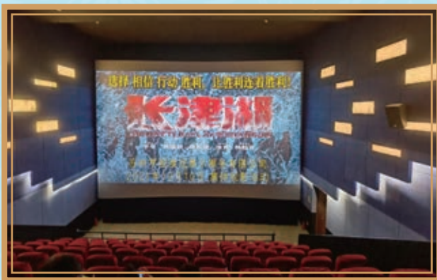
The Group's subsidiary, Suzhou Henge, organized a group activity for its employees to watch Battle of Chosin Reservoir 集團下屬蘇州亨冠公司組織員工集體觀影長津湖