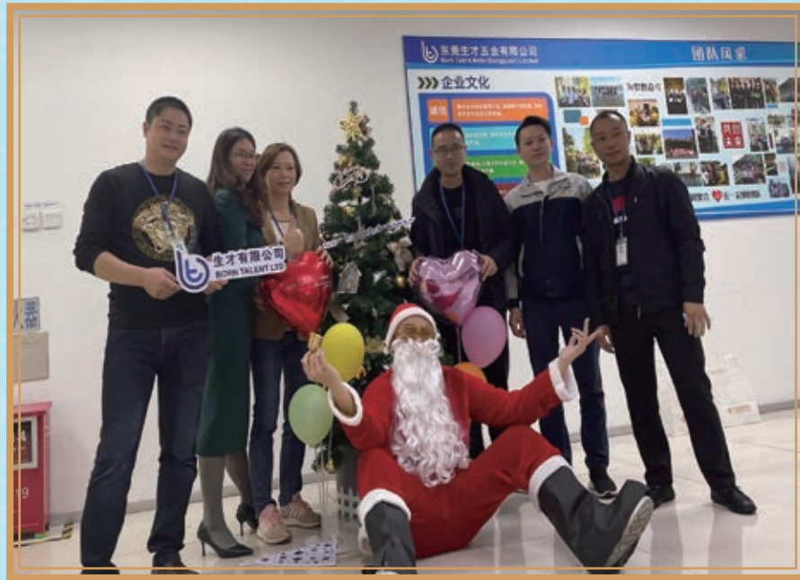
The Group's subsidiary, Dongguan Born Talent, held a Christmas party 集團下屬東莞生才公司聖誕活動