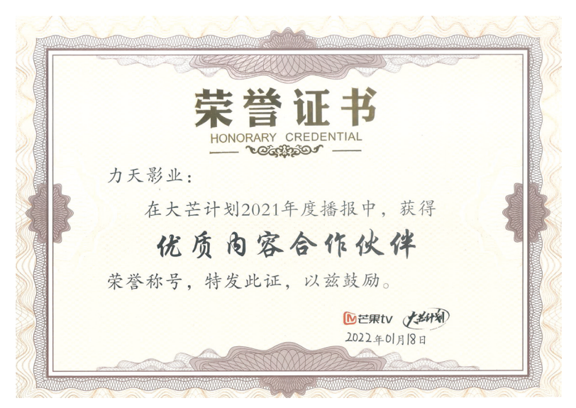
Winning Honorary Title of Quality Content Partnership in 2021

In the future, we will continue to strengthen our drama series production and distribution capabilities with the focus on producing more high-quality drama series and distributing them to leading satellite TV channels. In the meantime, more resources will be invested to actively develop and produce more web series of different genre to meet the various preferences of audiences of different age groups. Committed and professional, we will continue to improve our overall competitiveness to consolidate and enhance our position in the PRC drama series market. As the Group's primary business is drama series distribution, we do not involve recalling products for safety and health reasons.