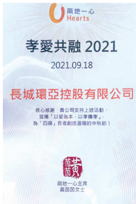
U-hearts President Appreciation Certificate 「兩地一心」主席感謝狀

二零二一年九月十八日，在中秋節日前，本公司捐贈了300個「福袋」予非營利組織「兩地一心」慈善機構的獨居長者及低收入家庭，「福袋」內物資主要包括防疫物資、口罩、及其他日常用品和食品等，以期為有需要的人士提供實用的援助，共渡疫情困難期。