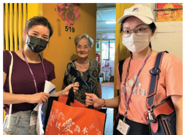
U-hearts Elderly Caring Program 「兩地一心」長者關懷計劃