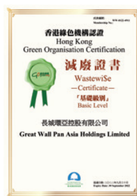
Wastewi$e Certificate (Basic Level) 減廢證書『基礎級別』