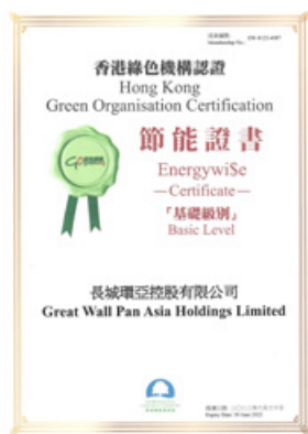
Energywi$e Certificate (Basic Level) 節能證書『基礎級別』

本公司在報告期內，獲得綠色認證機構頒發的「節能證書『基礎級別』」及「減廢證書『基礎級別』」，肯定了我們在實踐環境措施的付出和成就。