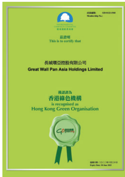
Hong Kong Green Organisation Certificate 「香港綠色機構」證書