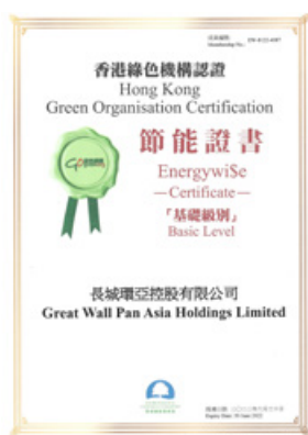
Energywi$e Certificate (Basic Level) 節能證書『基礎級別』

本公司在報告期內，獲得綠色認證機構頒發的「節能證書『基礎級別』」及「減廢證書『基礎級別』」，肯定了我們在實踐環境措施的付出和成就。