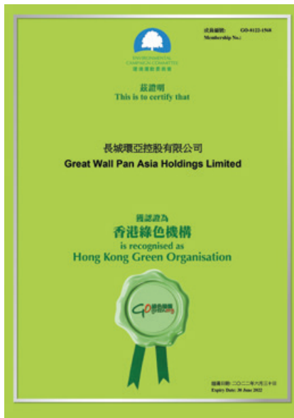
Hong Kong Green Organisation Certificate 「香港綠色機構」證書