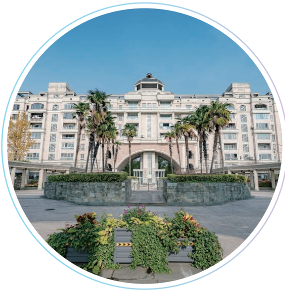
TOMSON GOLF VILLAS AND GARDEN 湯臣高爾夫別墅及花園