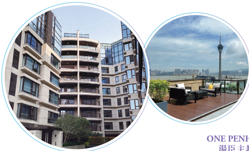
ONE PENHA HILL 湯臣主教山壹號

於截至二零二一年十二月三十一日止年度，該項目確認銷售所得款項約19,950,000港元，佔本集團之經營收益總額約2.53%。於二零二一年十二月三十一日，實用面積約6,700平方米之住宅單位可供出售。