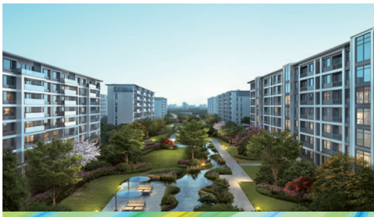
Cloud Land 蒲荷芸邸

Xixi Future Square (Royal Bay) is located at Xian Lin Street, Yuhang District, Hangzhou and consists of residential and commercial parcels, with a total GFA of about 109,782 sq.m., among which, the GFA of housing stock amounted to 16,788 sq.m. The project consists of multi-storey, small high-rise and high-rise buildings as well as townhouses, and is surrounded by well-developed community facilities. The project is constructed in three phases: Plot E, Plot C and Plot F, with a total GFA of about 92,994 sq.m., and commenced construction in 2019. Plot E was opened for sale in the fourth quarter of 2020. The pre-sales of Plots C and F started in the second quarter of 2020. It was completed in 2021. The volume of sales of the project during the year under review was within expectation.