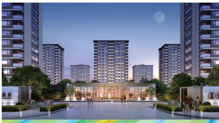
Shunyuan Mansion 順源府

It is located in Longgang Future Community, Wenzhou. It consists of high-rise buildings and shops, with a total floor area of approximately 69,369 sq.m. and a total GFA of approximately 168,141 sq.m., and is for residential use. The project commenced construction in the fourth quarter of 2021, and started the pre-sale in the fourth quarter of 2021. It is expected to be completed in 2024. The volume of pre-sales of the project during the year under review was within expectation.