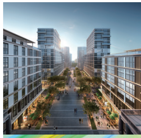
Fashion Color City 明彩城

西溪未來里(悅溪灣)位於杭州市餘杭區閑林街道，由住宅和商業地塊共同組成，總建築面積約為109,782平方米，其中存量房建築面積16,788平方米。該項目包括多層、小高層、高層和排屋，周邊有完善的社區配套。該項目分E地塊、C地塊、F地塊三期建設，總建築面積約為92,994平方米，2019年均已開工。E地塊於2020年第四季度開盤銷售，C地塊、F地塊於2020年第二季度啟動預售。該項目於2021年底前竣工。於回顧年度，該項目銷售符合預期。