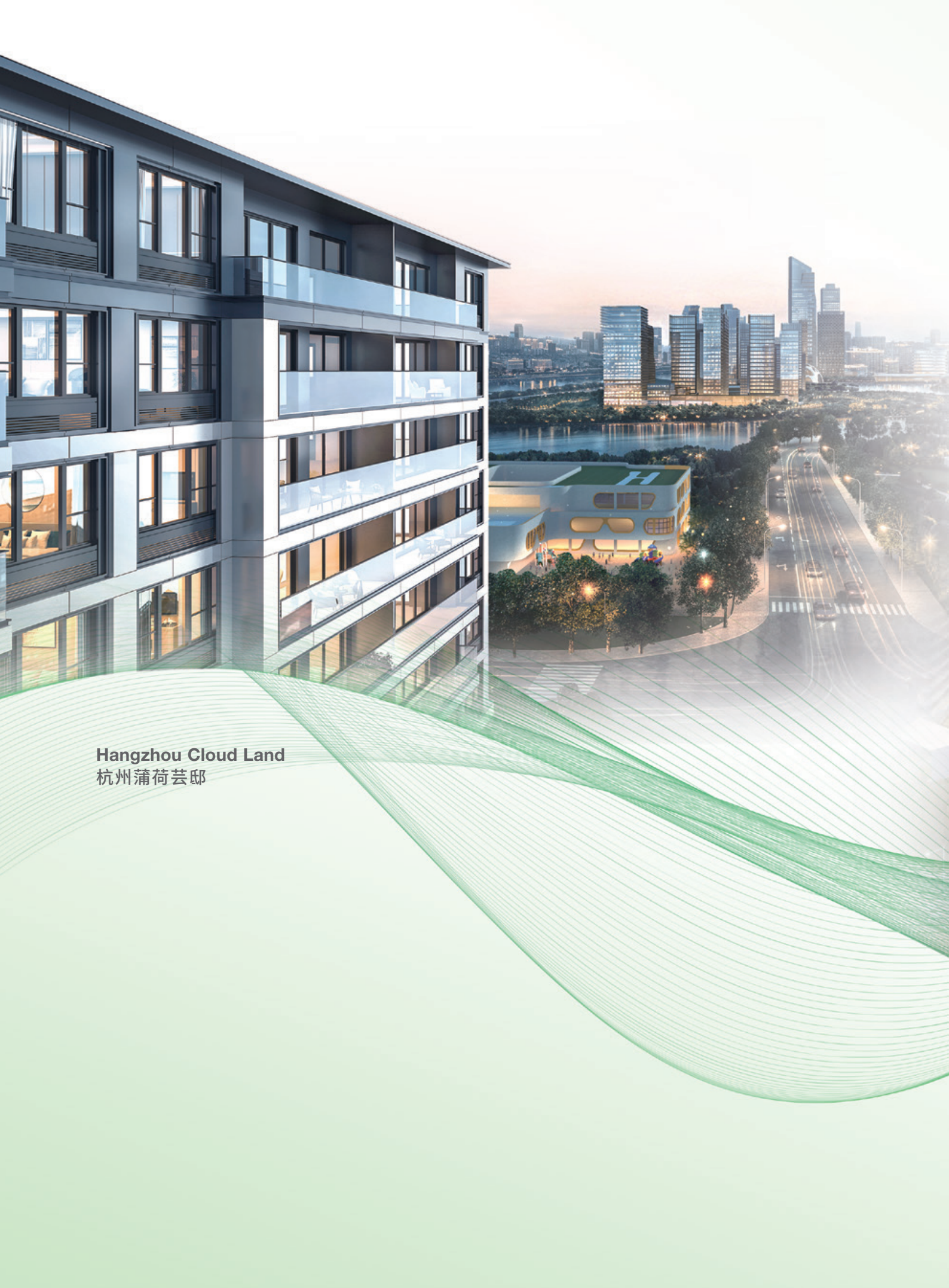
Hangzhou Cloud Land 杭州蒲荷芸邸