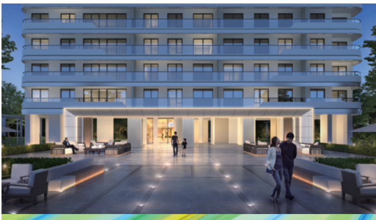
Wenzhou Future City 溫州未來社區

The year of 2021 was a year of steady development for Zhong An. Despite the turbulent market conditions and frequent occurrence of "black swans", Zhong An has always adhered to the core business philosophy of "stability" and moved forward steadily. Under the circumstance that the market environment is constantly changing, everyone in the Group is united to overcome the obstacles and difficulties. We also managed to keep pace with the times, actively embrace changes, achieve self-transformation, and successfully make a record high for the contracted sales. While maintaining economies of scale, the Group also enhanced the service quality in all aspects, and strived for high-quality development.