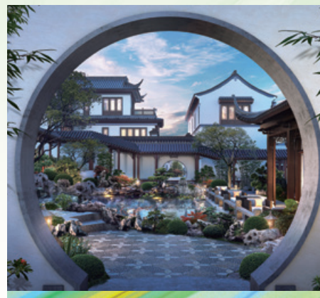
Guyue Mansion 古越郡府

Twenty-four years of hard work have honed Zhong An's excellent team and created its unique values. Zhong An has been operating steadily and developing healthily without touching the "three red lines". The management team has the courage to take responsibility, dare to be the first, and be innovative and proactive. In the future, the Group will continue to steadfastly uphold the strategic policy of healthy development and steady progress, and focus on the people-oriented approach as a core. On one hand, we will continue to develop steadily to focus on the bright future and create a better future with the cities. On the other hand, we will create a harmonious working environment, a stable career prospect and a happy life in Zhong An for our employees.