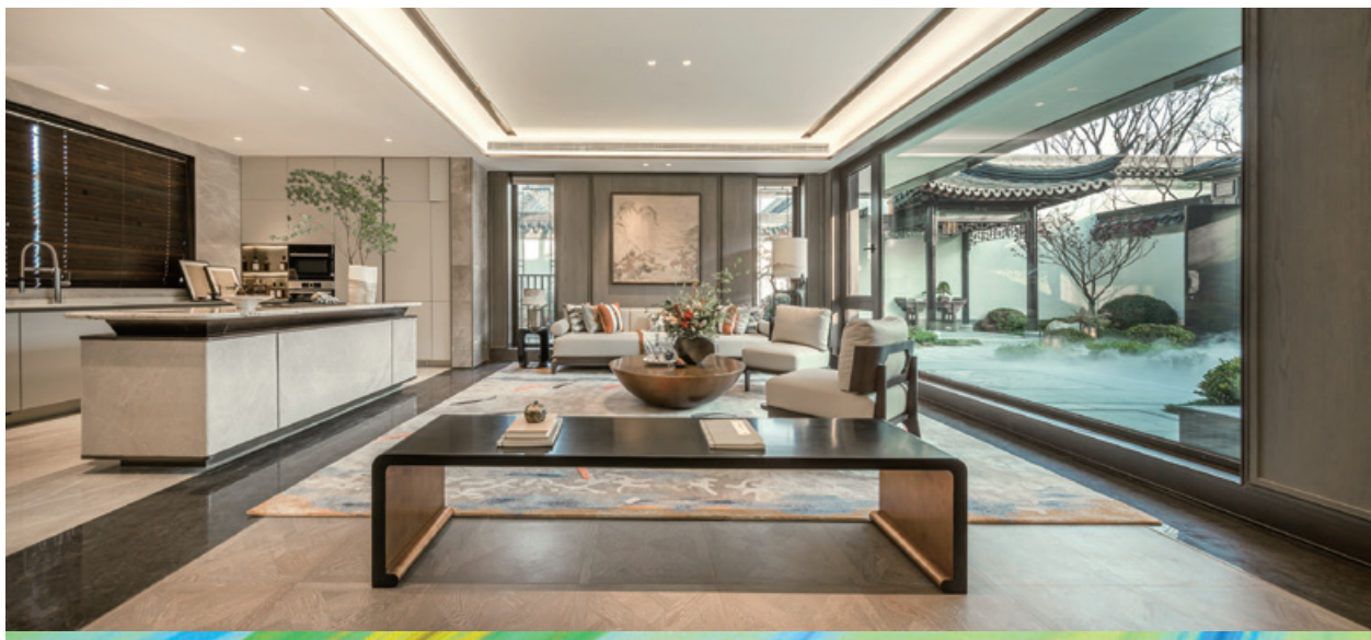
Tong Song He Ming 棠頌和鳴