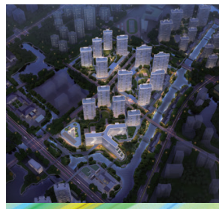
Wenzhou Future City 溫州未來社區

位於溫州市龍港未來社區，由高層及商舖組成，總佔地面積約69,369平方米，總建築面積約168,141平方米，作住宅用途。項目於2021年第四季度開工，於2021年第四季度啟動預售，預期於2024年竣工。於回顧年度，該項目預售符合預期。