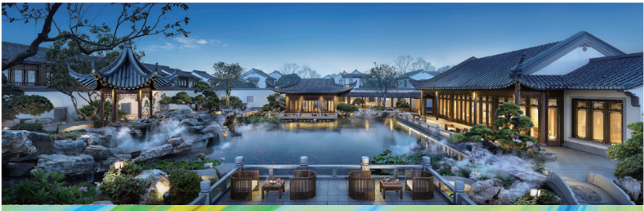
Nan Hu He Yuan 南湖荷院