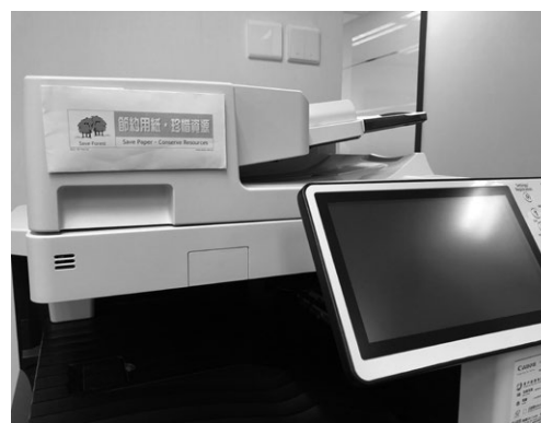
Notice of Printing and photocopying control for paper saving. 張貼列印及影印管制通知以節約用紙。