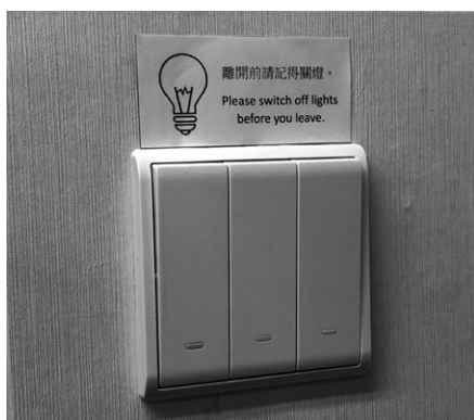
Energy saving signs remind staff members to turn off the lights after using in order to promote energy conservation. 張貼節能標誌提醒員工用後關燈以推動節能。