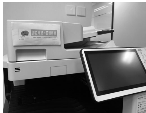
Notice of Printing and photocopying control for paper saving. 張貼列印及影印管制通知以節約用紙。