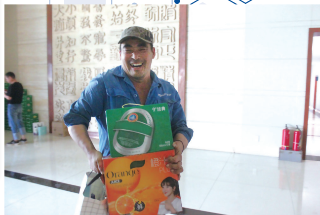
Cool off in summer 夏日送清涼