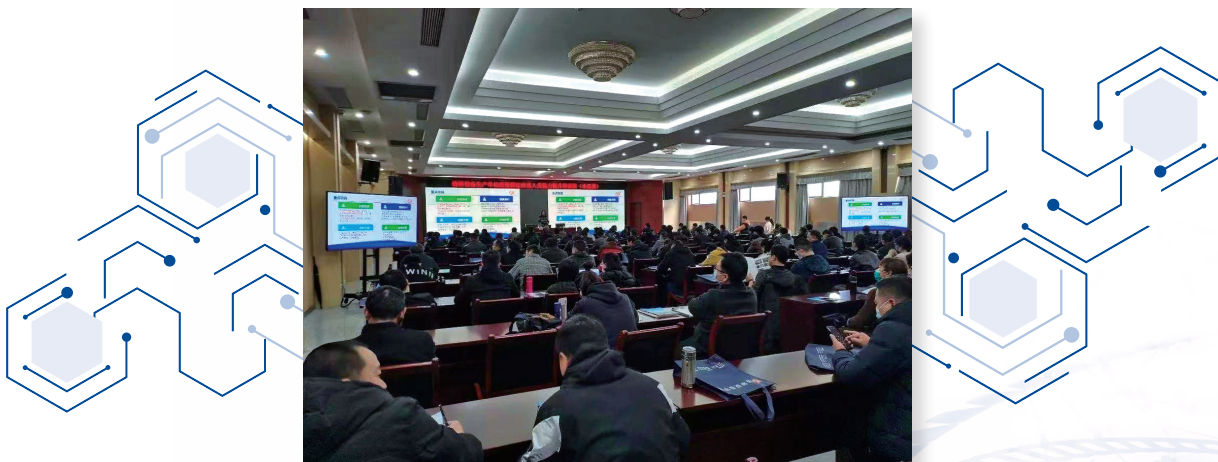
Special equipment unit system training 特種設備單位系統培訓

與此同時，我們明白員工增值對企業發展有莫大裨益，所以會向取得與工作有關的專業資格的員工發放證書補貼，以推動持續進修的企業氛圍。