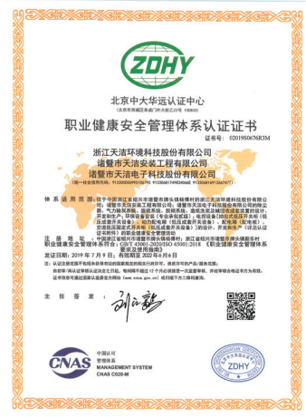
《職業健康安全管理体系認證證書》 Occupational Health and Safety Management System Certification (GB/T 280012011/ISO45001:2018)