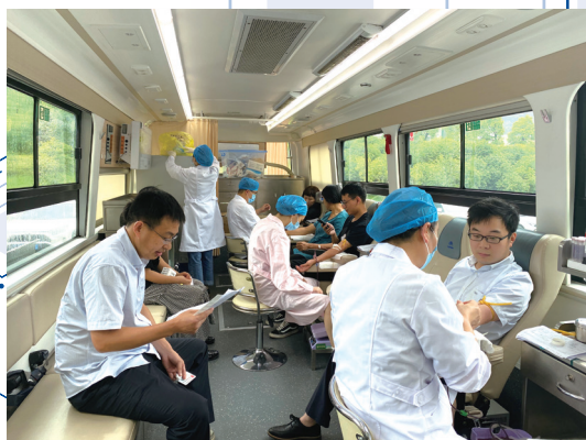
Voluntary blood donation campaign 自願捐血活動

同時，本集團深信青年人是社會未來的主人翁，我們深知要把青年人培養成材，投放資源，使他們能發揮所長是重中之重。在報告期間，我們安排了實習人員到本集團的展廳參觀交流，就企業發展和技術創新情況進行分享。本集團承諾將持續關心社會，以共同邁向可持續的未來為目標。