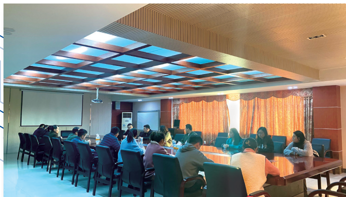
Anti-corruption related legal knowledge training 反貪污相關法律知識培訓

報告期間，我們並沒有發現涉及違反有關貪污、賄賂、勒索、欺詐及洗黑錢的法律和規例的訴訟及投訴，亦未知悉有任何經提出並已審結的貪污訴訟案件及訴訟結果。