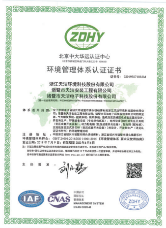
《環境管理體系認證證書》 Environmental Management System Certification (GB/T 24001-2016/ISO 14001:2015)