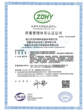
《質量管理體系認證證書》 Quality Management System Certification (GB/T 19001-2016/ISO 9001:2015)

During the production process, we generate a number of direct and indirect air pollutant emissions. Direct emissions are mainly due to the use of diesel, unleaded gasoline and other fuels in self-owned vehicles and forklifts. Indirect emissions mainly come from the electricity consumption in the production process, mainly used for different electric machinery and instruments, such as vacuum oil filters, cranes, etc. In addition, we also involve welding, sandblasting, painting and other processes in the production process, which will generate air pollutants and dust.