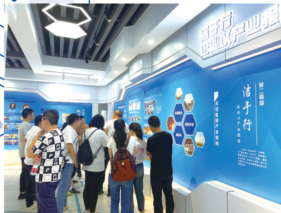
Interns visited the Group's exhibition hall 實習人員到本集團的展廳參觀交流