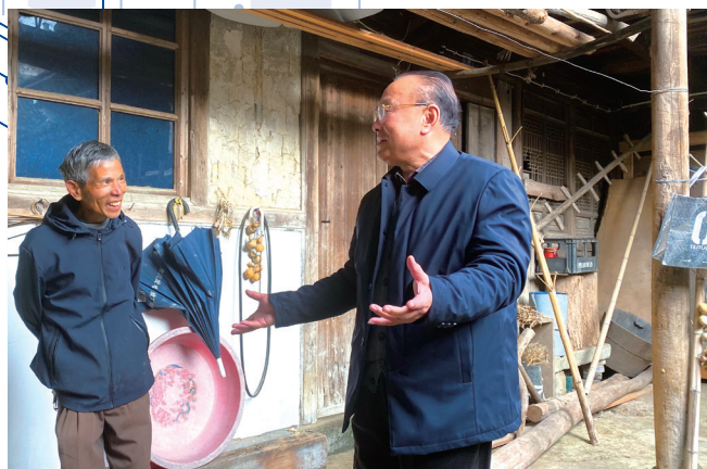
Care for employees in need – warmth sending activities 慰問困難職工—送溫暖活動