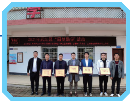
Assistance to Students activities 助學活動

本集團深明責任無處不在，應當對自己負責、對家人負責、對企業負責、對社會負責，重視企業形象與社會責任，並以「以人為本、履行社會責任」的管理方針，積極追求回饋及貢獻社會。本集團向來依法經營納稅，不遺餘力地協助解決當地的就業壓力。本集團為員工好好計劃退休生活作準備，為國內業務員工繳納五險一金，香港業務員工參加強積金計劃。本集團一直保持良好的生產經營、積極推行綠色環保理念及營造良好的發展秩序，在保持社會穩定及建設和諧社區方面，有一定的貢獻。於報告期內，本集團於疫情期組織「隔人不隔心」活動，慰問復工返回工作地區的隔離人員，我們還組織慰問核酸防疫人員活動及捐贈10,000個口罩予有需要人士。此外，我們還給予廣東韶關的貧困學生人民幣10,000元的助學金，以及組織慰問退伍軍人與消防人員。