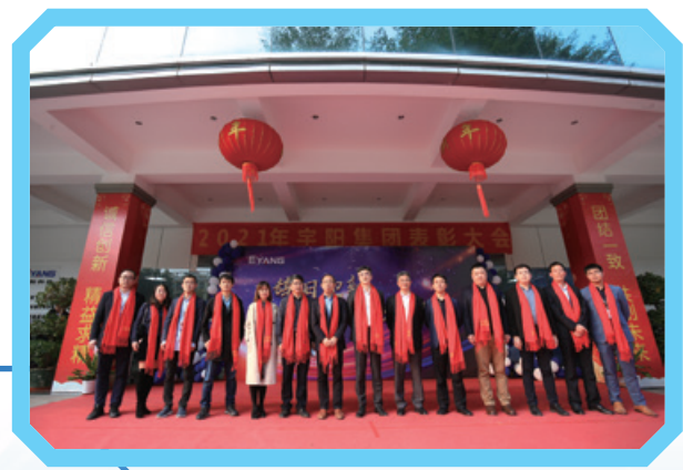
Staff Activities 員工活動