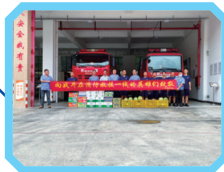
Condolences to Epidemic Prevention Personnel and Fire Brigade Activities 慰問防疫工作人員與消防人員活動