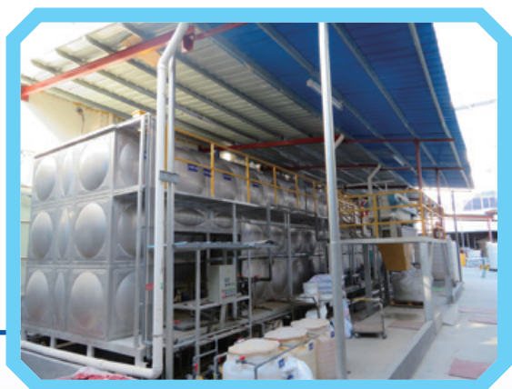
Sewage Treatment Facilities 廢水處理設施

本集團不斷提升及改造污水處理設施，每天進行檢查、維護和保養等管理，記錄日常運作情況。於報告期內，東莞廠房原污水處理站已經停止運作，新增一體化包括污水處理及污水回收設施，優化廢水處理工序。同時，廠房亦定期清洗沉澱池中的沉積物及更換沉澱池內的部件，以穩定廢水中的各種物質含量並達標排放。目前廢水中的各種物質含量均達標排放。而滁州廠房按照《建設項目環境影響後評價管理辦法（試行）》規定，委託了專業環境治理機構評估現有的廢水處理設施與設備，並按照建議優化相關設施與設備，廠房已於電鍍廢水處理站旁增設消泡水處理設施；並按照國家《排污許可申請與核發技術規範—電子工業》的要求，於電鍍廢水處理站的排水口安裝流量與鎳的線上監測設備，以及於廠區內的總排水口安裝流量、酸鹼值、化學需氧量與氨氮的線上監測設備。