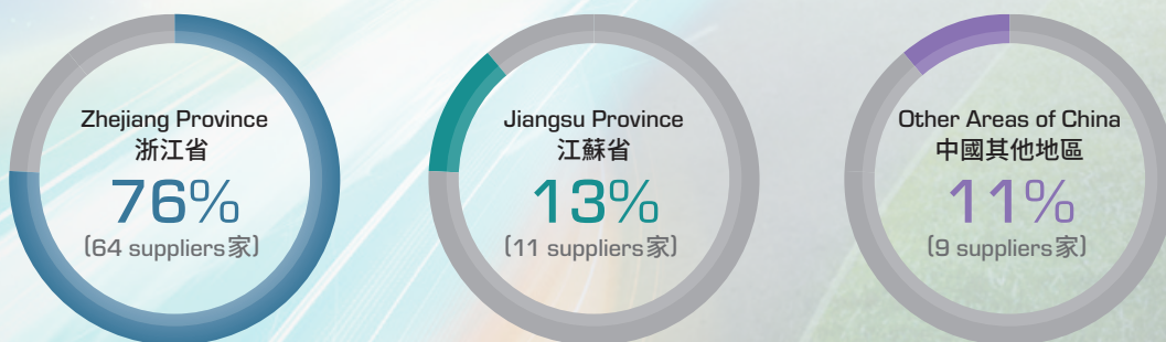
The Number of Suppliers of Puxing Energy by Region 普星能量按地區劃分的供應商數量

年內，本集團共有新進供應商36家，共有合格供應商84家，在已合作供應商的審核中，向其執行與ESG有關慣例的供應商數目為55家，比例為65%。未來，本集團計劃在供應商准入及評估流程中進一步細化ESG相關評估因素，以提升供應鏈可持續性。