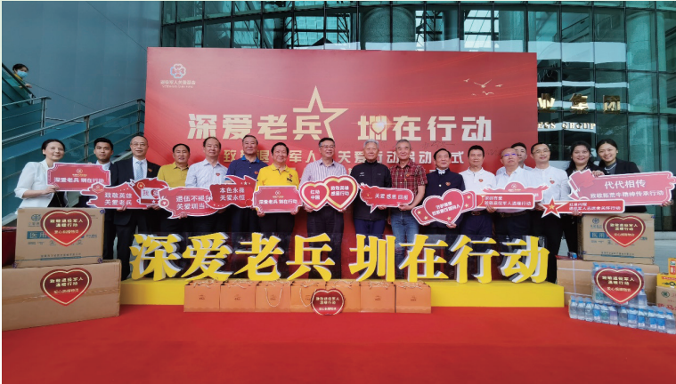
Caring for veterans