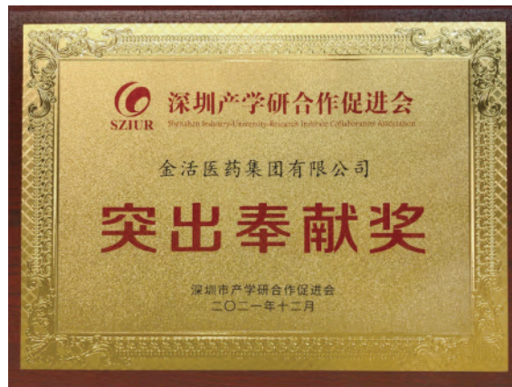
The Group won the Industry-University-Research Outstanding Contribution Award