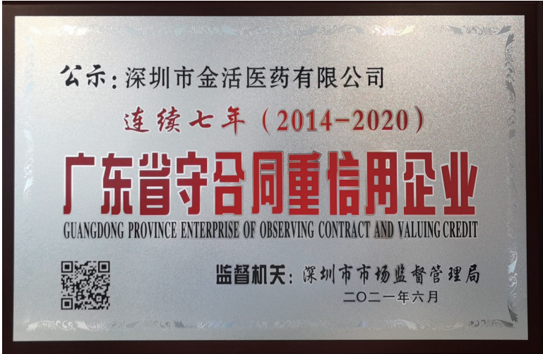
The Group was awarded the title of Guangdong Province Enterprise of Observing Contract and Valuing Credit for seven consecutive years