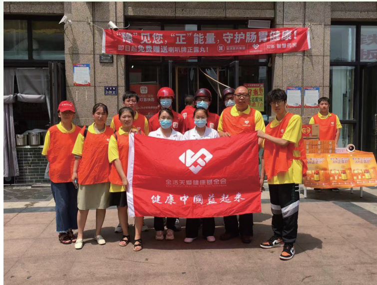
The Group donated Seirogan Pills to the flood-stricken areas in Henan Province to protect citizens' gastrointestinal health.