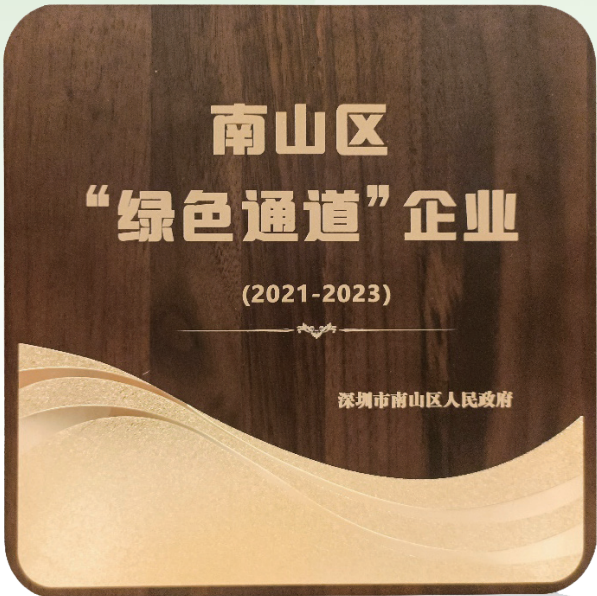
The Group was awarded the Green Passage Enterprise by the Government of Nanshan District