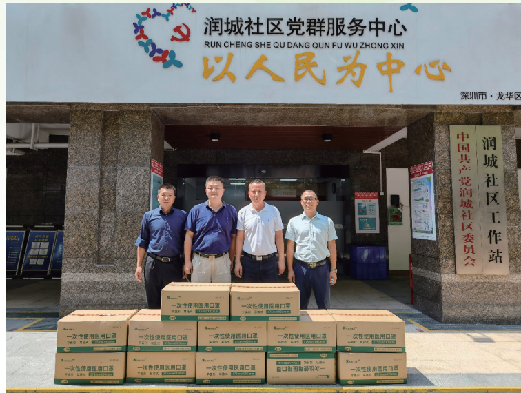
The Group donated masks to frontline grassroots organizations for fighting against the pandemic.