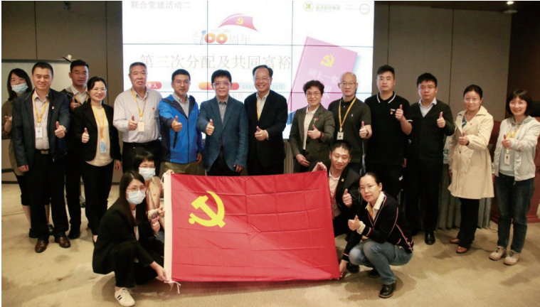
The Group cooperated with Taohuayuan Foundation to carry out joint party building activities.