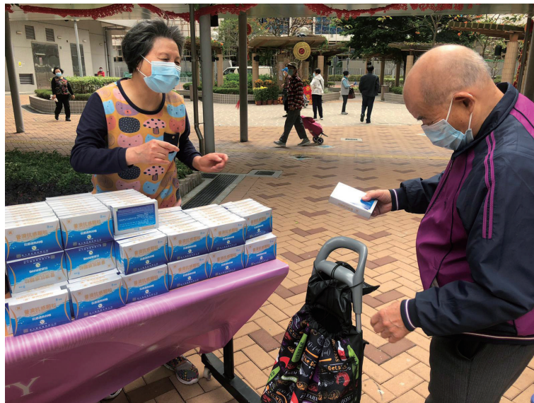
Caring for the elderly in the community during the pandemic