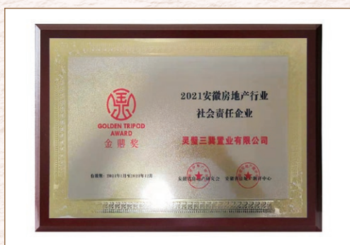
2021 Socially Responsible Enterprises in Anhui’s Real Estate Industry 2021安徽房地產行業社會責任企業