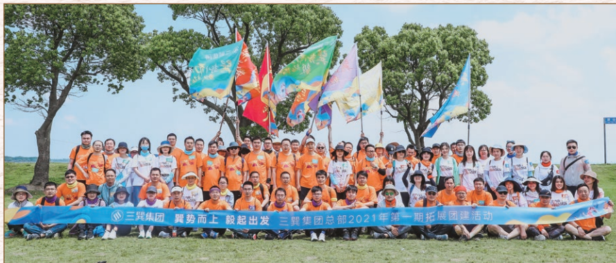
Outdoor Development Activities 戶外拓展活動

本集團十分重視員工的福祉，秉持著以人為本的精神，我們致力為提供良好的發展空間及具競爭力的薪酬待遇和員工福利制度。為了增強員工對公司的歸屬感，本集團制定了《福利管理制度》，除了法定員工福利，例如社會保險、住房公積金、帶薪休假及高溫補貼外，我們還給員工安排節日福利和特別福利，包括生日福利、結婚禮金、生育禮金、生病慰問金和慰唁金，也會提供日常補貼，包括交通補貼、通訊補貼、餐費補貼、電腦補貼及住房補貼，以激勵員工為企業長期服務，與我們共同成長。