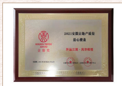
2021 Anhui Quality Assured Real Estate Project 2021安徽房地產品質放心樓盤