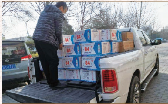
Donate protective materials to medical staff of Lixin Hospital 向利辛醫院醫務人員捐贈防護物資