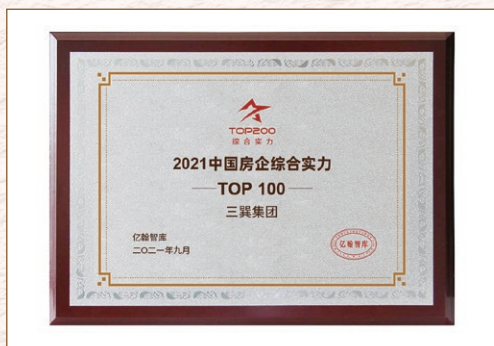
2021 Top 100 China Real Estate Enterprises in Comprehensive Strength 2021中國房企綜合實力百強

本集團及旗下項目在本年度榮獲多個獎項與認同。本集團已經連續3年躋身「中國房企綜合實力百強」及「中國房地產公司品牌價值百強」，是對本集團的企業及品牌實力的認可和肯定。另外，本集團榮獲多項社會責任相關獎項，是對本集團於社會貢獻的肯定。本集團將繼續秉持「創造幸福生活」的初心，致力提供更優秀的設計和更高質量的服務，持續為環境、顧客、員工和股東創造更多價值。