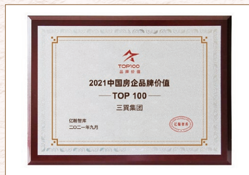
2021 Top 100 China Real Estate Enterprises in Brand Value 2021中國房地產公司品牌價值百強