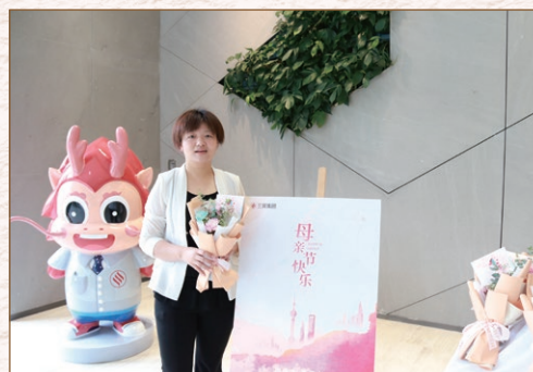
On Mother's Day, we gave blessings and flowers to great mothers. 母親節，為偉大的媽媽們送上祝福與鮮花。