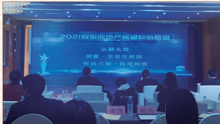
Anhui Real Estate Summit Forum 安徽房地產高峰論壇

本集團一直以來積極參與房地產行業裡具影響力的研討會及戰略峰會，通過分享及討論行業諮詢與同行互相學習砥礪，在掌握市場的動向的同時也協助推動中國房地產行業的發展，促進社會高質量發展和提升城市可持續發展的價值。在未來，本集團會繼續鞏固自身在房地產產業鏈的戰略佈局，致力優化產品和服務品質，不斷強化自身的競爭力。