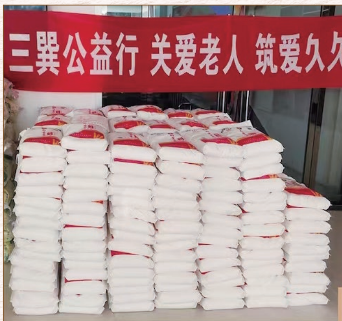
Activity of caring for the elderly was carried out at Dujia Village Community in Ningyang County on the Double Ninth Festival and flour was donated to them.

本集團聚焦於「救災」、「扶貧」、「教育」及「弘揚中華文化」四大領域，通過捐助金錢、商品、服務和直接援助等方式助力公益事業發展，而本年度，本集團於脫貧攻堅以及公益事業上投入近人民幣130萬元。本年度，本集團在中國多個省份及地區以捐贈或贊助方式參與以下一系列的慈善活動：