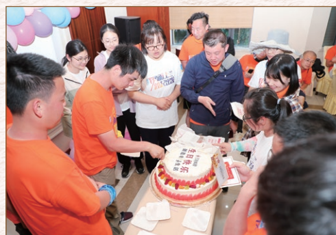
During the quarterly birthday "home party", the administrative department prepared delicious snacks, fun games and exquisite gifts for employees to celebrate their birthdays. 季度生日「轟趴」，行政部門精心準備美味茶歇、趣味遊戲及精美禮品為員工慶生祝賀。