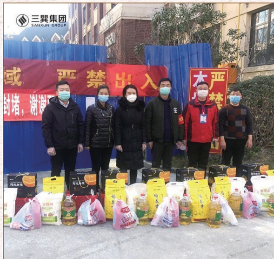
The Company's party members took the lead in distributing anti-epidemic materials on the front line during the holiday 公司黨員同志帶頭放棄假期，身赴一線發放抗疫物資