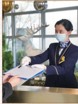
Staff shall conduct disinfection and entry and exit registration before entering the office 進入辦公場所做好消毒殺菌和進出登記工作