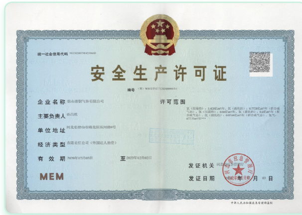
TTG has obtained the Production Safety License for the production of compressed and liquefied gases such as oxygen, nitrogen, argon and hydrogen, which is valid from 3 December 2020 to 2 December 2023

The Group strictly observes the Product Quality Law of the People's Republic of China (2018 Amendment) (《中华人民共和国产品质量法(2018修正)》) and is responsible for the quality of the products it produces. According to the Implementation Regulations of the Drug Administration Law of the People's Republic of China (2019 Amendment) (《中华人民共和国药品管理法实施条例(2019修订)》), unlicensed drugs are not allowed to be produced in the PRC. Before issuing licenses, relevant government authorities will conduct inspection on the production facilities of drug manufacturers and determine whether the sanitary conditions, quality assurance systems, management structures and equipment in the facilities meet the required standards. The drug production license is valid for five years.