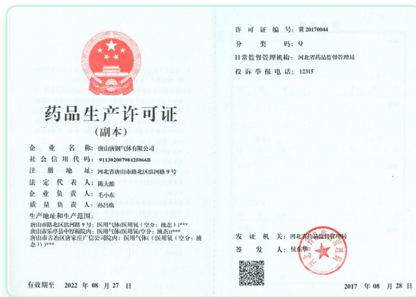
TTG has obtained the Drug Production License for the production of medical gas and liquid medical oxygen, which is valid from 28 August 2017 to 27 August 2022

The Group strictly observes the Product Quality Law of the People's Republic of China (2018 Amendment) (《中华人民共和国产品质量法(2018修正)》) and is responsible for the quality of the products it produces. According to the Implementation Regulations of the Drug Administration Law of the People's Republic of China (2019 Amendment) (《中华人民共和国药品管理法实施条例(2019修订)》), unlicensed drugs are not allowed to be produced in the PRC. Before issuing licenses, relevant government authorities will conduct inspection on the production facilities of drug manufacturers and determine whether the sanitary conditions, quality assurance systems, management structures and equipment in the facilities meet the required standards. The drug production license is valid for five years.