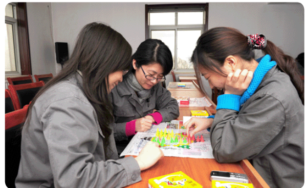
Chess and cards activities