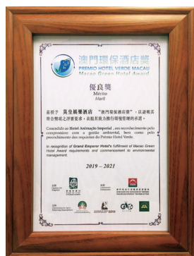
Macau Environmental Protection Bureau Macao Green Hotel Award – Certificate of Merit, 2019-2021