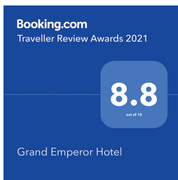
Booking.com Traveller Review Awards 2021