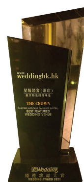
WeddingHK Best Featured Wedding Venue: The Crown