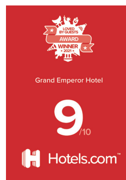
Hotels.com Loved By Guests Award 2021