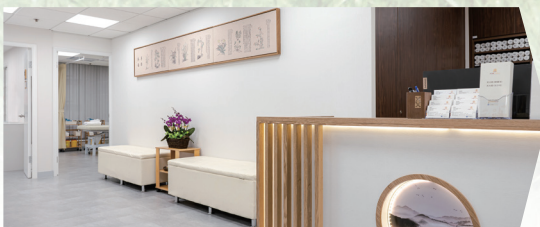
TDMall (Tsim Sha Tsui) 天大館(尖沙咀)