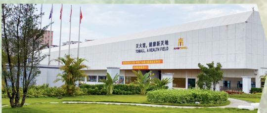
Zhuhai TDMall 珠海天大館