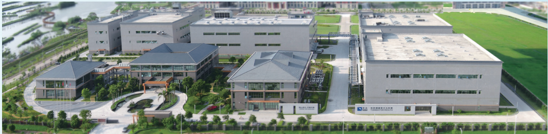
New R&D and Production Base (Jinwan District, Zhuhai) 新研發及製藥基地(珠海金灣)