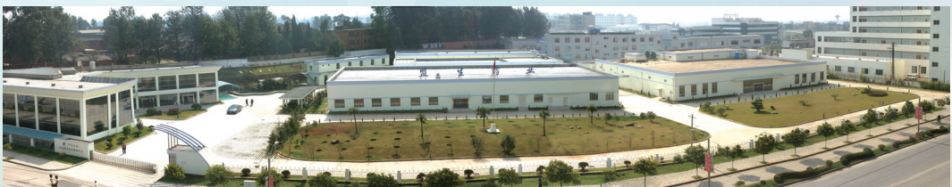
R&D and Production Base (Kunming, China) 研發及製藥基地(昆明)