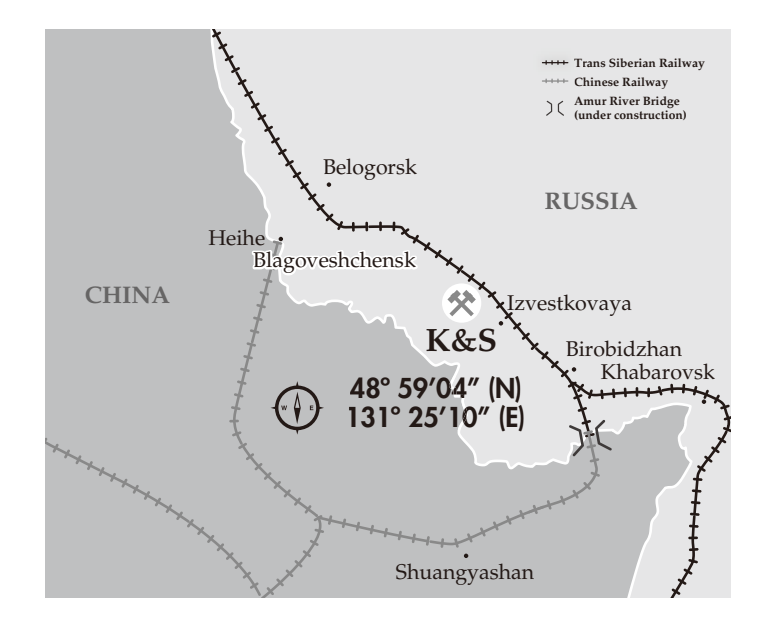
K&S 100% owned