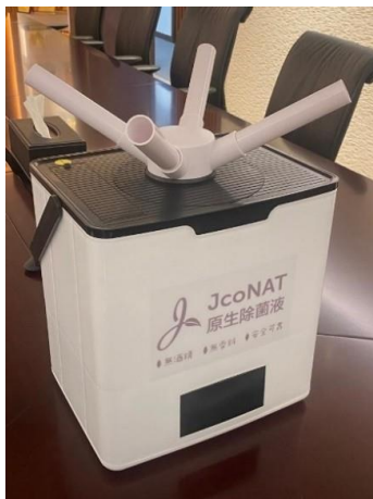
Air purifiers are placed in office premises to improve air quality

A hygienic and clean environment also contributes greatly to employees' health. We improve the water quality and air quality at the office by installing water filters and air purifiers to promote employees' physical well-being. We also expect employees to keep the office clean and tidy all the times.