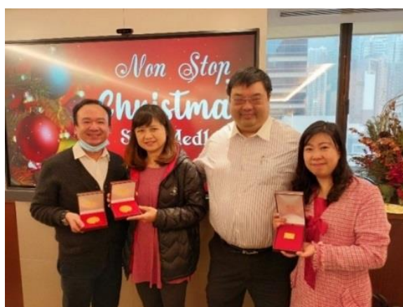
Our Christmas party 2021 with Long Service Awards presentation