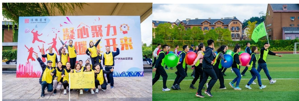
Chongqing Outdoor Development Training Camp in October 2021