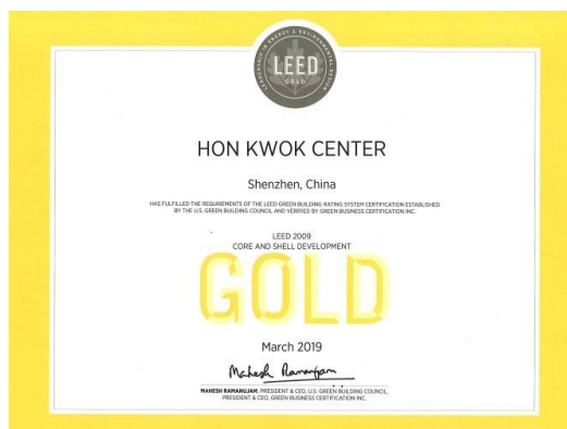
LEED Gold Certification – Shenzhen Hon Kwok Centre

The Group values the sustainability of its business and strives to incorporate environmentally friendly elements into operations. Aiming to promote green and sustainable building design with good air and water quality management, we certify our properties with green building standards. Our Chongqing Hon Kwok Centre and Chongqing Jinshan Shangye Zhongxin have obtained WELL health certification, Shenzhen Hon Kwok Centre was also accredited with the Leadership in Energy and Environmental Design (“LEED”) Gold certification and WELL Health-Safety Rating (“WELL HSR”). Besides, our HKG11, the newly developed data centre in Hong Kong obtained BEAM Plus Certification from Hong Kong Green Building Council Limited. In future, we target to increase the number of properties with green building certifications.