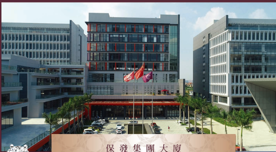
保發集團大廈 PERFECT TOWER