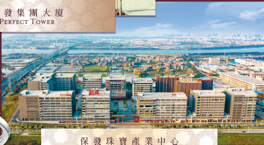
保發珠寶產業中心 PERFECT GROUP JEWELLERY INDUSTRY PARK