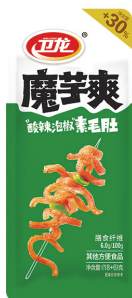
net weight: 24g