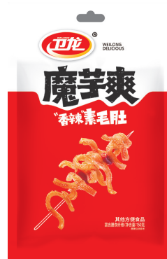
net weight: 150g