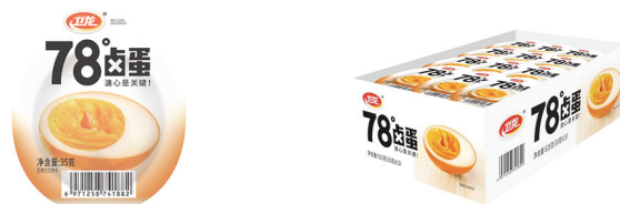
net weight: 35g

78° Braised Egg (78°滷蛋) is a new product we launched in 2021. By using our unique temperature-controlled slow-cooking techniques, we strive to preserve the rich nutrients, tender texture, and delicate taste of egg white and yolk, while giving it a mellow braising taste with a little spicy flavor. Its eye-catching egg-shaped package design provides a fun experience for consumers.