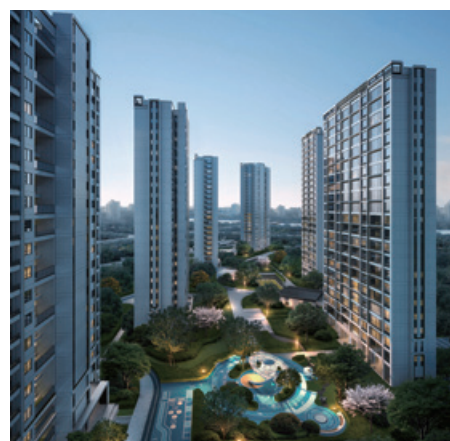
Shaoxing • Future City 紹興 • 未來社區