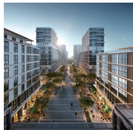
Hangzhou • Fashion Color City 杭州 • 明彩城

位於杭州市餘杭區未來科技城，由多層組成，總佔地面積約46,737平方米，總建築面積約74,779平方米，作住宅用途。該項目於2021年第一季度開工，於2021年第三季度啟動預售。預計與2023年竣工。於回顧年度，該項目預售符合預期。截至目前，除部分車位及少量房源外，已基本售罄。