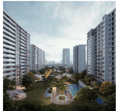
Hangzhou • Lan Lotus Mansion 杭州 • 嵐荷芸府