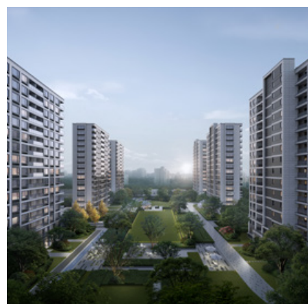
Hangzhou • Zecui Ju 杭州 • 澤翠居

位於浙江省寧波市北侖區大碶松花江路站南地塊，主要由小高層組成。總佔地面積約17,393平方米，總用地面積約為31,307平方米，作住宅用途。項目於2021年第三季度開工，於2021年第四季度啟動預售，預期於2023年竣工。於回顧年度，該項目預售符合預期。