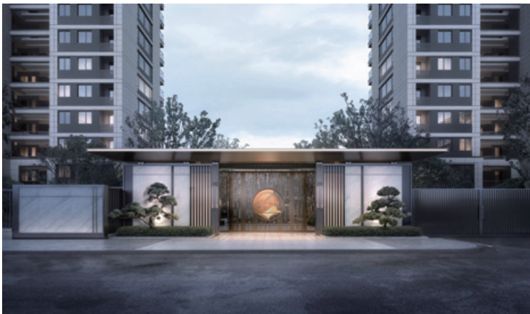
Hangzhou • Chuyue Mansion 杭州 • 漣玥府

酒店營運方面，年內雖然受到疫情管控及消費者出行慾望降低等不利因素影響，但酒店集團管理層轉變思維，積極佈局「一體兩翼」戰略計劃。通過主題餐廳餐飲品牌的打造，聚焦餐飲經營能力提升，超額完成營收等各項指標。並獲得行業的高度認可，收穫了包括「金鼎級特色文化主題飯店」在內的一系列業內含金量較高的榮譽。