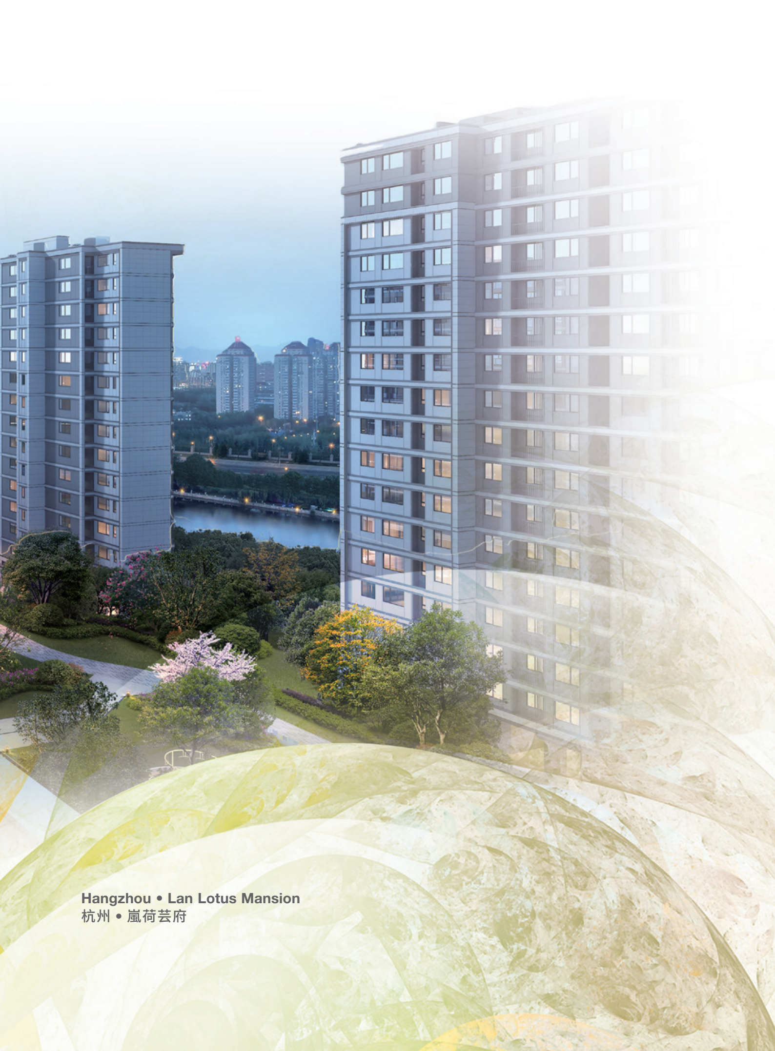
Hangzhou • Lan Lotus Mansion 杭州 • 嵐荷芸府