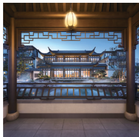
Yiwu • Xiuhu Lotus Garden 義烏 • 秀湖合院

The Group will adhere to the brand concept of “Enjoying a Better Life”, combine with Zhong An’s brand strengths and build a full-scale layout around “real estate +”. On the one hand, it adheres to the workmanship standard of “excellent quality of Hangzhou workmanship” to create high-quality living quarters; on the other hand, it deepens the layout of multiple industries such as commerce, service, hotel, film and television, education, cultural tourism, and finance. We are committed to becoming an integrated service provider that meets people’s needs for a better life by gradually turning their ideas of a better life into real life scenarios. We also focus on the “Healthy China” strategy, continue to pay attention to the ageing of society, and continue to promote medical care and health management for the elderly. We are committed to improving people’s well-being and quality of life.