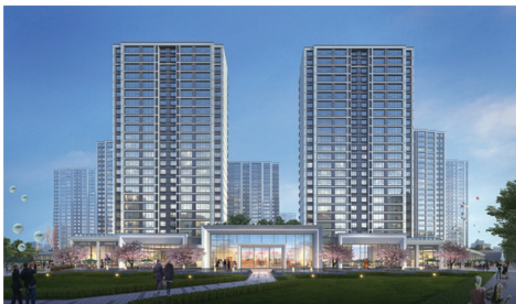
Hangzhou • Bin He Yin 杭州 • 濱和印

位於紹興市柯橋區福全未來社區，由人才房、辦公及商鋪組成，該項目還包括回購安置房的建設。項目總佔地面積約78,484平方米，總建築面積約211,907平方米，作住宅用途。項目於2021年第四季度開工，與2022年第三季度啟動預售，預期於2025年竣工。於回顧年度，該項目預售符合預期。