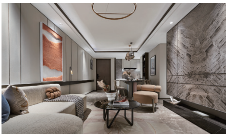
Ningbo • Chaoyue Mansion 寧波 • 潮悅府

It is located at the south site of Daqi Songhuajiang Road station in Beilun District, Ningbo, and consists of small high-rise buildings, with a total floor area of approximately 17,393 sq.m., and a total GFA of approximately 31,307 sq.m., and is for residential use. The project commenced construction in the third quarter of 2021 and started the pre-sale in the fourth quarter of 2021. It is expected to be completed in 2023. The volume of pre-sales of the project during the year under review was within expectation.