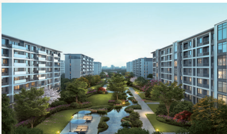
Hangzhou • Cloud Land 杭州 • 蒲荷芸邸

It is located in Yuhang District, Hangzhou City of Future Science and Technology, It consists of multi-storey buildings, with a total floor area of approximately 46,737 sq.m. and a total GFA of approximately 74,779 sq.m., and is for residential use. The project was commenced construction in the first quarter of 2021 and started the pre-sale in the third quarter of 2021. It is expected to be completed in 2023. The volume of pre-sales of the project during the year under review was within expectation. So far, it is sold out apart from some car parking lots and a few housings.