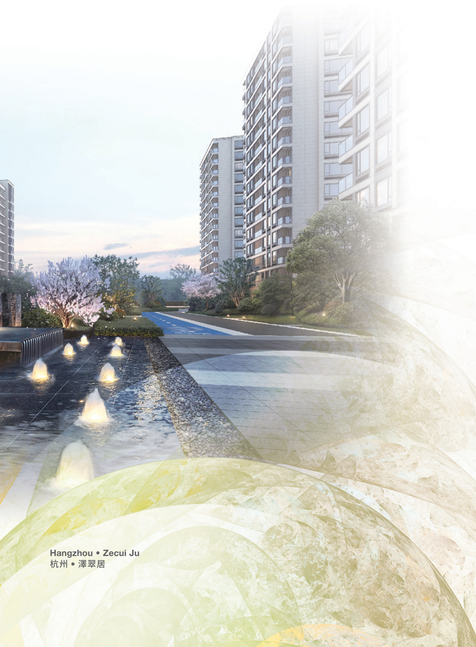
Hangzhou • Zecui Ju 杭州 • 澤翠居