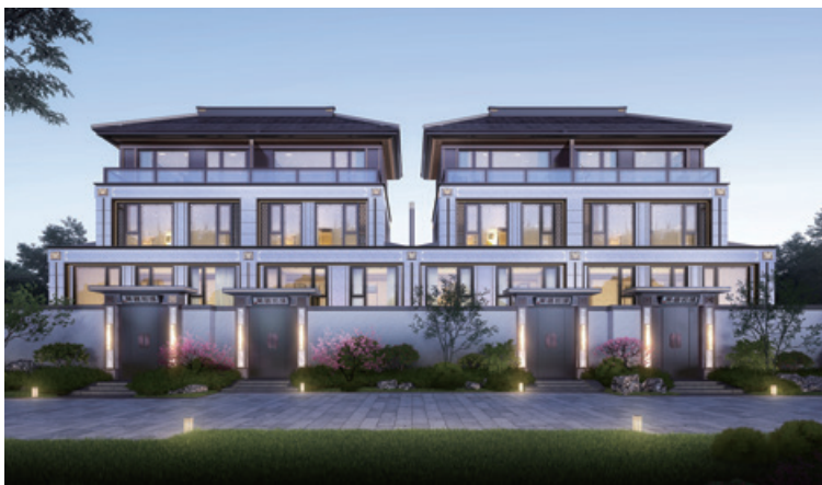
Shaoxing • Tong Song He Ming 紹興 • 棠頌和鳴