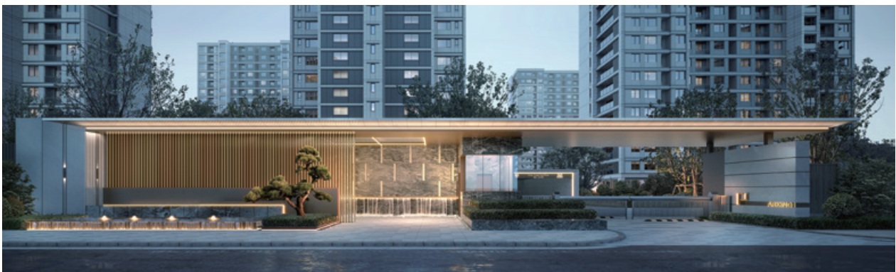
Hangzhou • Lan Lotus Mansion 杭州 • 嵐荷芸府

在市場環境不斷變化的情況下，本集團上下一心，攻堅克難。在保持規模效益的同時，全力以赴保交樓。南湖明月、荷源府等多個樓盤的如期高質量交付，獲得消費者的一致好評。在過去的一年裡，本集團共有62個在售項目，主要分佈於長三角多個城市和地區，合約銷售保持平穩推進，銷售回款提前達標。截至2022年12月31日止年度，本集團錄得全年合同銷售金額約為人民幣14,267.7百萬元，全年合同銷售面積約750,710平方米，合同銷售均價約為每平方米人民幣19,006元。