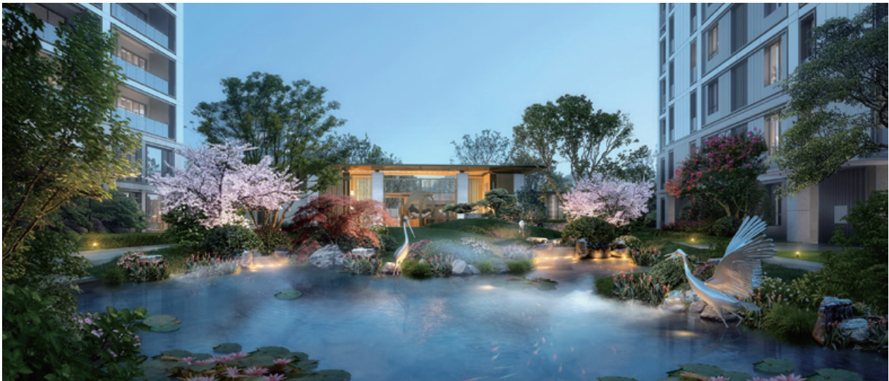
Yiwu • Lakeside Mansion 義烏 • 湖畔名邸