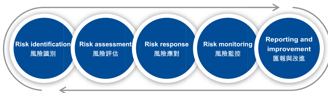
Figure 2: Risk management process 圖二：風險管理流程