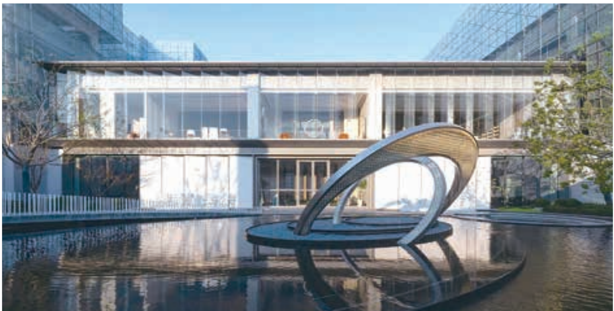
• Phase 7 of Shangqiu Jianye Hopsca City 商丘建業十八城七期

和過去兩年疫情爆發的經驗和規律來看，2022年的疫情最大的問題是這一輪的疫情沖擊到了中國經濟龍頭城市和核心區域，這些城市的經濟階段性停擺，造成的損失包括後續的連鎖反應，不容小覷。從2021年下半年開始，除了一線城市和經濟基本面強勁的新一線城市以及部分省會城市，絕大多數中國城市的房地產經濟領域，還有樓市房價就存在明顯的下行承壓情況，民營房地產開發商去杠桿，降風險，延續進入2022年，樓市持續普遍低迷，房價缺乏支撐。因為疫情，絕大多數人的經濟基本面受到沖擊，對現金流和未來預期的態度產生了負面變化。