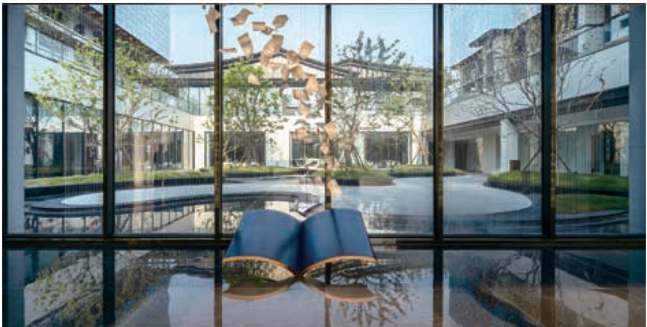
• Luoyang Mengjin Jianye Cloud Mansion 洛陽孟津雲著

在房地產開發成本高企、融資環境收緊、行業利潤下滑的背景之下，房地產行業正在尋求從「土地紅利」、「金融紅利」向「管理紅利」時代的轉型。房地產代建模式是全球城市化推進到一定階段、行業成熟的標誌，其以其輕資產、高盈利、抗週期等優勢，成為眾多房企探索新模式的重要選項。結合國家及各省「十四五」規劃政策，房地產行業供給側改革方向愈發清晰，推動保障性租賃住房建設，城市更新或成趨勢。同時，市場加速整合背景下，中小房地產代建業務需求將逐步提升。近年中央和地方密集出台政策，加快發展保障性租賃住房，我國初步計劃「十四五」期間40個重點城市新增650萬套（間）保障性租賃住房，其中