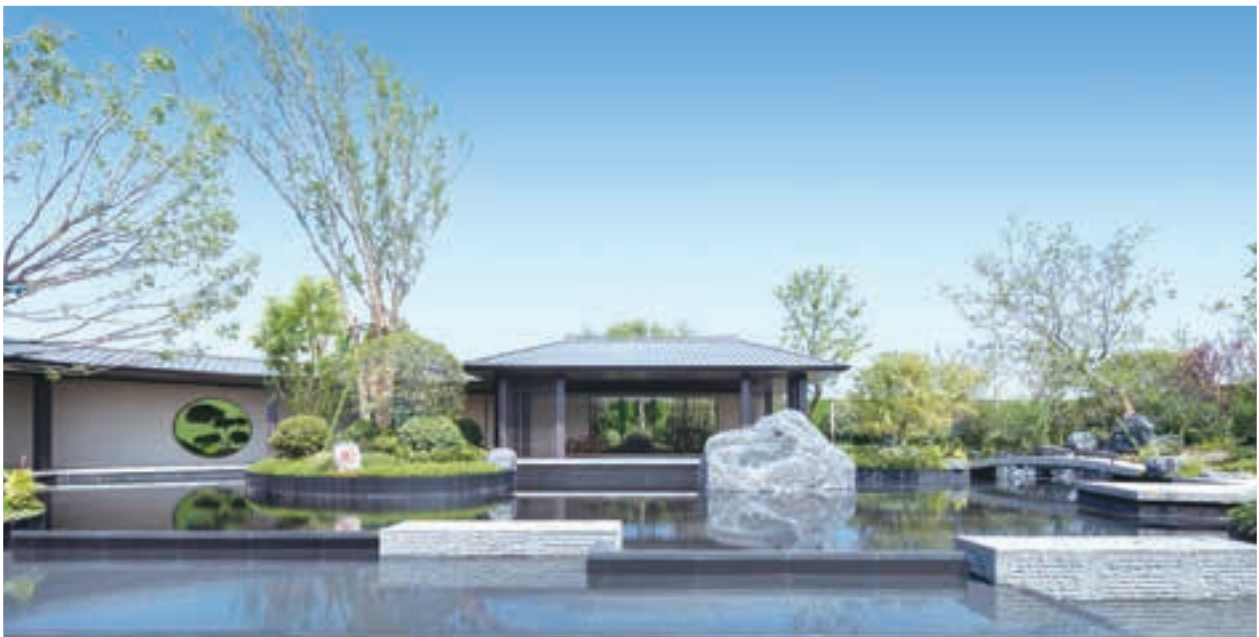
• Baofeng Jianye Purple Gardens 寶豐建業紫園

2022年，疫情、戰爭和通脹、加息等因素是全球經濟影響的關鍵詞，隨著各國對疫情管控的全面放鬆，經濟活動都將得以復蘇、逐漸向好。面對嚴峻復雜的國際形勢和接踵而至的巨大風險挑戰，中央政府穩字當頭、穩中求進，更好統籌國內國際兩個大