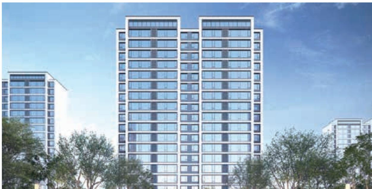
• Nanyang Jianye Wonderland 南陽建業雲境