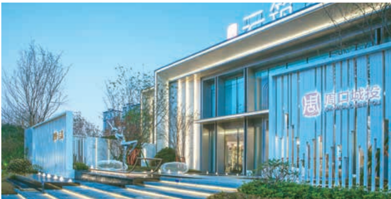
• Zhoukou Jianye Cloud Mansion 周口建業雲築

maintaining stability, took a holistic approach to both the domestic and international situation, better coordinated the pandemic prevention and control with economic and social development, better coordinated development with security, focused on high-quality development, promoted the creation of a new development pattern, enhanced the internal driving force for domestic circulation and improve the quality of international circulation, laying a long-term value foundation for the sound development of enterprises. China's GDP amounted to RMB121.02 trillion in 2022, with an actual growth rate of 3.0%. Henan Province's GDP totalled RMB6.13 trillion, representing a year-on-year increase of 3.1%, which was 0.1% higher than the national average. From the perspective of economic indicators, China's economy slowed down, while Henan Province's primary economic indicators maintained growth momentum, outperforming the national average. Henan, as an economic powerhouse, gave full play to the key supporting role of stabilising the national economy and shouldered the responsibility of making more contributions to the national economy.