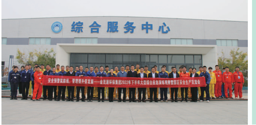
The 2022 Comprehensive Emergency Drill Observation and Safety Exchange in Tianjin Park

During the year, the Group held a comprehensive emergency drill observation and safety exchange in Tianjin Park. The Safety Committee of the Group, the five major park management, risk control, mechanical and electrical and other relevant persons in charge were invited to the meeting. With the safety concept of the top 20 countries as its purpose, and in line with the purpose of "solving practical problems, summarizing practical experience, and discussing future development", the meeting focused on the key points and hot spots of safety production, in the industrial parks, and shared and discussed special tasks such as source management, risk control, and emergency rescue in the industrial parks, to find path of the safety system and capacity system construction for the industrial parks. The meeting emphasized safety as the eternal theme. The industrial parks should further strengthen their refined management, implement and refine safety management, and make progress for the safe production in 2023 in the industrial parks and the Group with greater determination, more favorable measures and more effective actions.