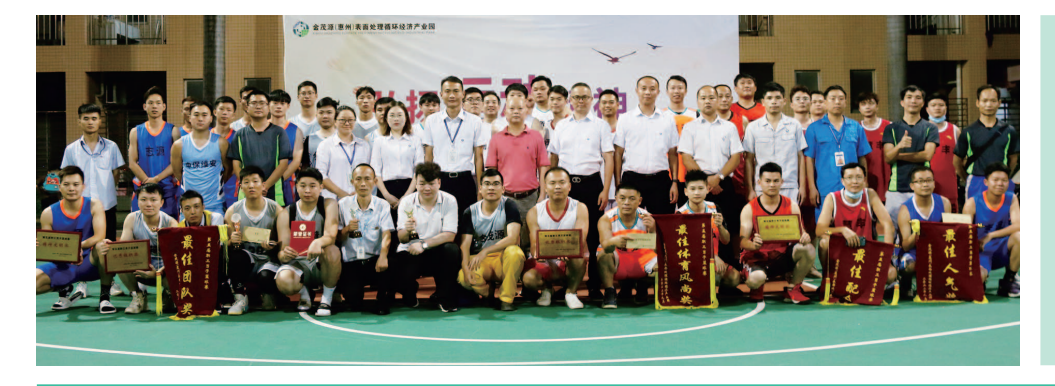
The Fifth Men's Basketball Competition in Huizhou Park