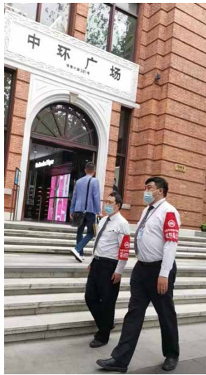
Security volunteers patrolling the streets 平安志願者巡邏