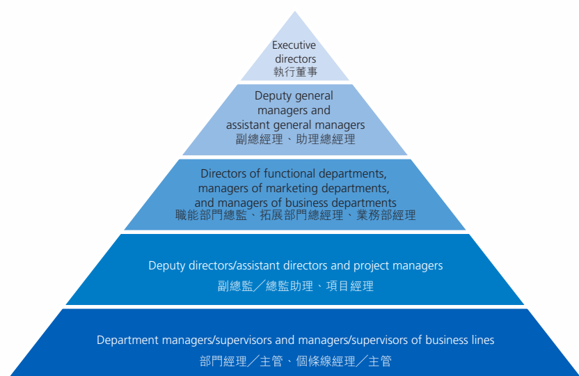
Career development path for elite personnel 「精英人才」職業發展通道

同時我們制定《HR-014內部人才培養與發展管理辦法》，通過內部人才的識別與發展，培養符合公司企業文化的各層級人才，實現人才培養的戰略化、精英化、專業化，為本集團業務發展提供戰略性人力資源支持。我們成立「人才發展委員會」負責精英人才培養及發展的戰略管控和評審工作，同時成立「人才發展工作小組」作為「人才發展委員會」下設具體事務執行部門，負責人才計劃的推動和實施工作。並制定考核機制以評估人才晉升情況。