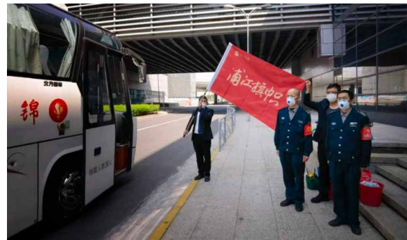
Makeshift hospital support staff 方艙醫院保障人員籌備工作

Due to the recurring and severe pandemic outbreaks during the Reporting Period, we were actively involved in the COVID-19 response in April 2022, by joining the rank of support staff for the makeshift hospital at National Exhibition and Convention Centre (Shanghai).