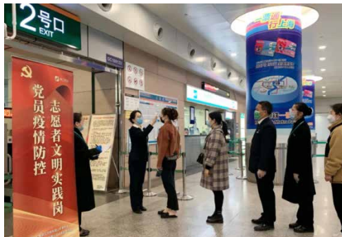
Volunteer service activity at the Pudong Airport Station of Shanghai Maglev 磁懸浮浦東機場志願服務活動

此外，2022年3月份為我們的學雷鋒活動月，本集團組織成立志願者隊伍，堅守在上海重點門戶磁浮浦東機場站的一線窗口崗位上，在做好自身防疫的同時，為來往乘客提供票價班次問詢、路線指引、行李搬運等志願服務工作。