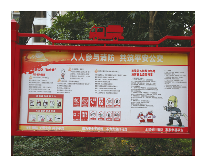
Notice board for preventing fire incident in the service site in Shenzhen