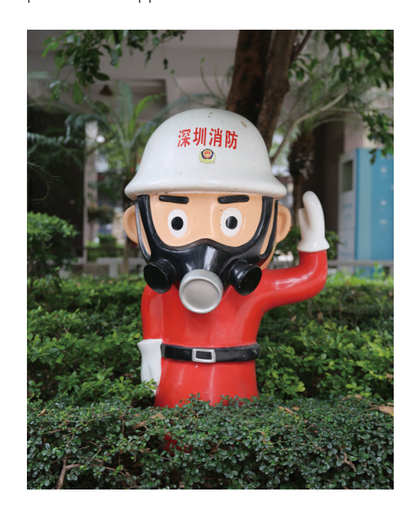
Fire safety equipment installed in the service site in Shenzhen

In response to the COVID-19 pandemic, the Group has adopted measures related to personal hygiene protection, which include but not limited to (i) requiring employees to wear masks and frequently wash hands; (ii) providing hand sanitizers for its employees; (iii) conducting regular disinfection of offices; and (iv) providing subsidies of HK$250 per month for each employee of Cheung Kee to purchase face masks and epidemic prevention supplies.