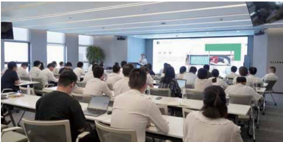
Special training on contract risk and duty crime risk prevention 合同風險與職務犯罪風險 防範專場培訓

本集團亦舉辦了不同類型的專業培訓專案，以提升不同崗位員工的專業知識和技能。以下是本年度本集團舉辦的專業培訓案例。