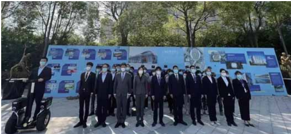
Shangcheng District Stadium 上城區體育中心

Dexin Service entered the urban cooperation project of the old residential area of Rehenan Road Street in Nanjing and deeply participated in the urban service of Rehenan Road Street in Nanjing with its service force. Within 3 months of entering, the company had provided services to the Jiangwei Road community, Xiaotaoyuan Community, Yangongmiao Community, Erbanqiao Community, and Baiyunting Community. Within the jurisdiction of these 5 communities, more than 20 districts, including Baiyunting District, Rehenan Road District, and Jiangwei Road District, have carried out property service work for tens of thousands of owner families.