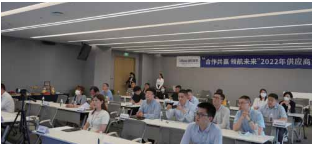
"Win-win cooperation and guiding the future" 2022 Supplier Conference “合作共贏 領航未來” 2022年供應商大會

集團堅持公開採購，對誠信受損或違反誠信協議的供應商給予零容忍，明確投訴和報告渠道，建立廉潔供應鏈。商業道德的調查包括在商業道德的探索中。我們以供應商的資質和信用作為庫存檢查的關鍵因素，要求所有合作供應商簽署誠信協議，並在協議履行過程中不時進行合規審核。