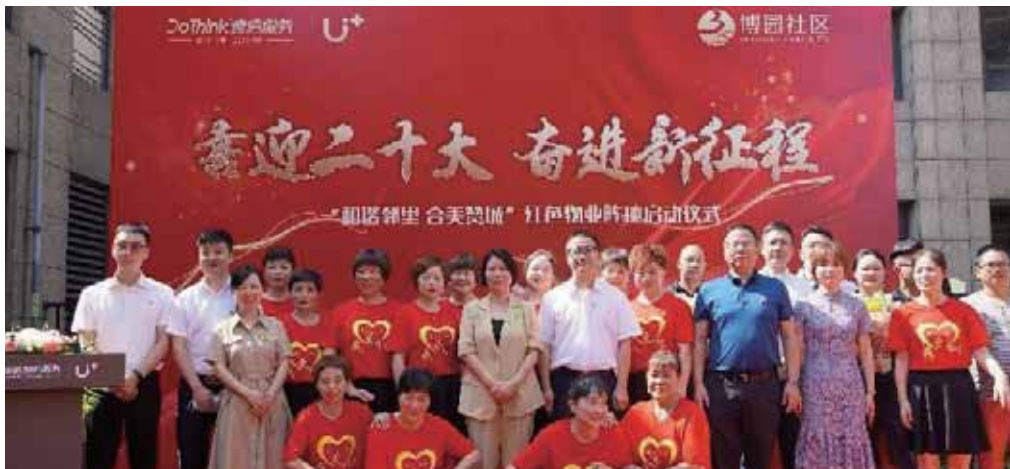
Red property position to build 紅色物業陣地打造

Representatives of the Group went to the field to participate in the public welfare activity of “Helping Common Prosperity” in Yuyan Village, Sixi Town, Taishun County, and Wenzhou City and donated funds. The funds were mainly used to help repair houses, visit local subsistence allowances and care for left-behind children.