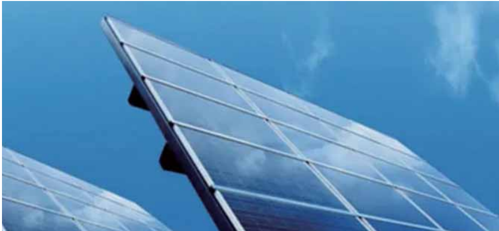
Photovoltaic energy storage transformation of Hangzhou Wings Project