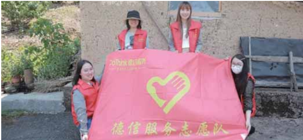
Children enjoy the Blue Sky Program 童享藍天計畫

德信服務與浙江省婦女兒童基金會、德信藍公益基金會一起，開展“童享藍天”計畫，長期幫扶杭州淳安縣的困境兒童，踐行暖心善舉。今年的公益活動德信服務捐贈9.8萬元愛心資金，與德信藍公益一起在2022年8月走進淳安縣富文鄉、千島湖鎮、文昌鎮、左口鄉等地，與當地的60名孩子組成了結對幫扶，將為每位小學生提供900元/年、初中生1350元/年、高中生2700元/年的資助標準，德信藍公益的志願者們實地走訪了部分淳安縣困境留守兒童，在孩子們家中志願者們深入瞭解他們的家庭情況，為每個孩子送上了一份築夢禮包。星星之火，可以燎原，今年8月，作為杭州亞運供應商的德信服務還發起“童享藍天”計畫「捐步行動」，推動公益與運動融入每個人的日常生活，成為一種生活方式。