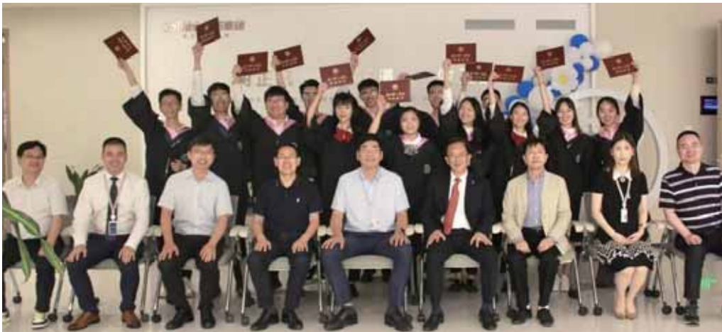
The Dexin Shengquan Class 德信盛全班

德信服務始終秉承公益之心，致力於公益事業。我們重點關注助學扶貧、教育公平等領域，我們已投放大量資源於貧困及留守少年兒童，讓他們得到公平的學習機會，快樂成長，同時透過累積知識創造屬於自己的未來。