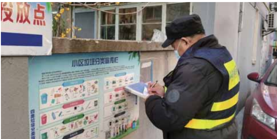
Rehenan Road street rectification site 熱河南路街道整改現場

集團深度合作政府公建類專案，運營業態有學校、醫院、博物館等多種類型，作為杭州亞運會的物業服務官方供應商，還為杭州市上城區體育館、浙江省湖州市奧體中心、溫州市樂清新體育館等體育場館專案提供物業服務。