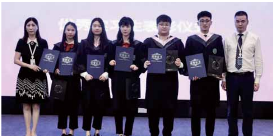
Company leaders awarded the "Outstanding Intern"