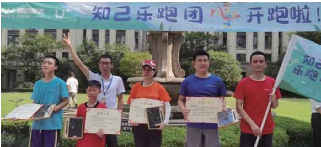
Bosom friend music run group 知己樂跑團

In order to promote national reading and create an atmosphere of respecting learning, the Group actively builds a “Common book bar downstairs in the community” which integrates digital, self-service and modern concepts, providing a good place for residents to read for leisure and improve themselves. There is also a special reading corner for children in the book bar, so that children in the community can have a small world to learn and grow together with their friends.