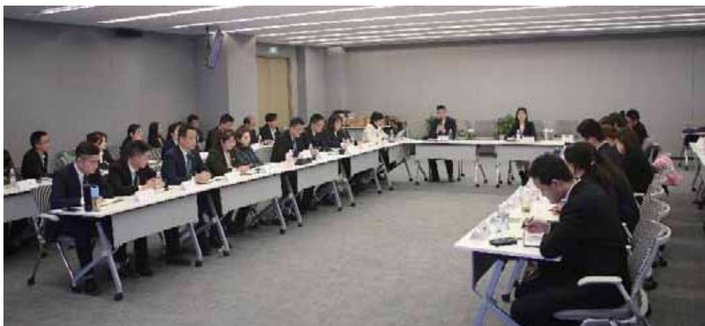
Staff exchange seminar 員工交流座談會

As a virtual team of recruits in the company, Shengquan Class 2 has set up a training period of more than 3 months with the 21–22 New Torch students. The group held a Growth Gas Station and conducted a training camp for students. In the training program of New Actions, different forms of empowerment and training would be used at each stage to help students accumulate experience, expand their thinking and gain new knowledge.