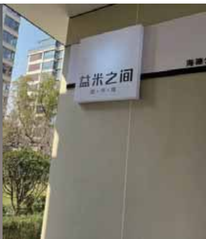
Community activity space 社區活動空間

為了推動全民閱讀，營造崇學尚學氛圍，本集團積極打造集數字化、自助化、現代化理念於一體的“社區樓下的共用書吧”，為居民休閒閱讀、自我提升提供了一個好去處。書吧內還專門開闢了幼兒閱讀角，讓社區的孩子們擁有一處和朋友共同學習成長的小天地。