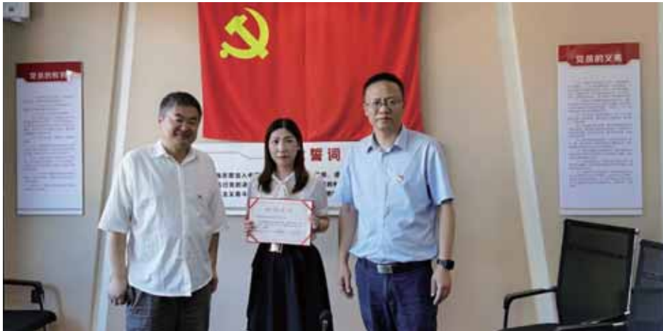
Taishun Yuyan Village "Help Common prosperity" public welfare activity 泰順玉岩村“助力共同富裕” 公益活動

集團代表赴實地參與溫州市泰順縣泗溪鎮玉岩村“助力共同富裕”公益活動，送上愛心捐贈資金，該筆資金主要用於幫助修繕房屋、慰問當地低保戶、關愛留守兒童。