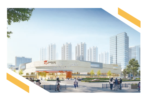
ZHUHAI GAOXIN POWERLONG PLAZA