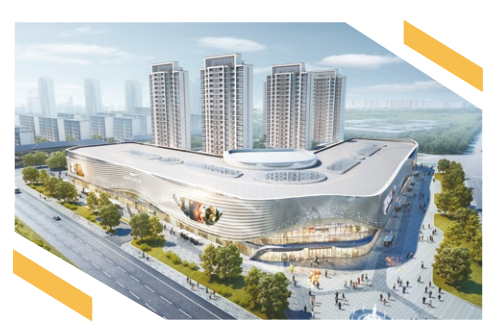
WUXI YIXING POWERLONG PLAZA