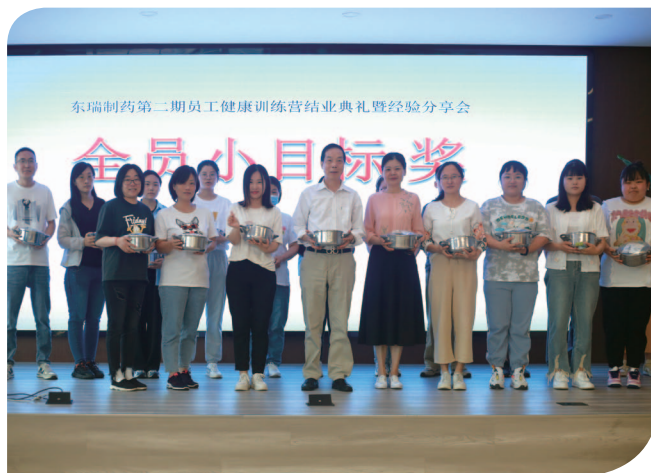
Employees' health training camp organized during the Reporting Period 於報告期間舉辦的員工健康訓練營

本集團重視人才的發展，鼓勵員工不斷學習新知識及技能，提高崗位勝任能力和從業能力，從而提升企業競爭力。在業務發展的同時促進員工個人自我成長和職業發展，雙方共同進步，因此本集團制定了《員工培訓管理規程》為員工提供各類型的素質培訓，例如針對各系統開展的專題訓練營、通用技能培訓、通用管理類培訓以及提升個人專業知識及技能的崗位專業類培訓。為更有效地使用資源，本集團每年會按照需要編寫年度培訓計劃，內容包括崗位專業技能及管理能力提升培訓。本集團設有內部培訓體系，並依據《員工手冊》第八章《內部培訓師管理規程》由管理層或具備相關知識的員工分享知識或經驗。此外，藥物的生產和管理不斷創新而監管法例繁複並經常更新，為能夠準確掌握各範疇最新知識，本集團定期外派員工參加藥政法規以及最新技術指導培訓，從而不斷吸收和掌握行業新知識。為更有效完善培訓內容及計劃，在每次培訓前進行培訓需求調研，培訓後進行培訓效果評估，以優化未來的培訓。