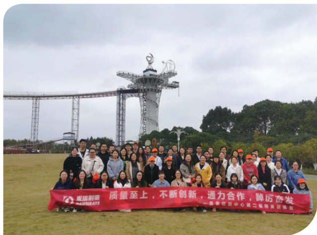
Employees' Outdoor Development Training organized during the Reporting Period 於報告期間舉辦的員工戶外拓展訓練