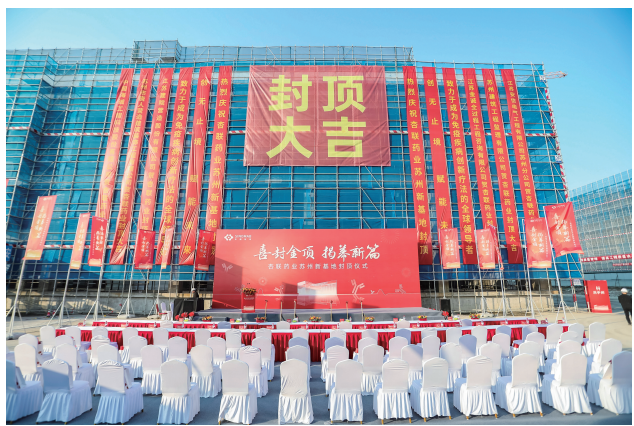
Topping-out ceremony for our Suzhou Campus