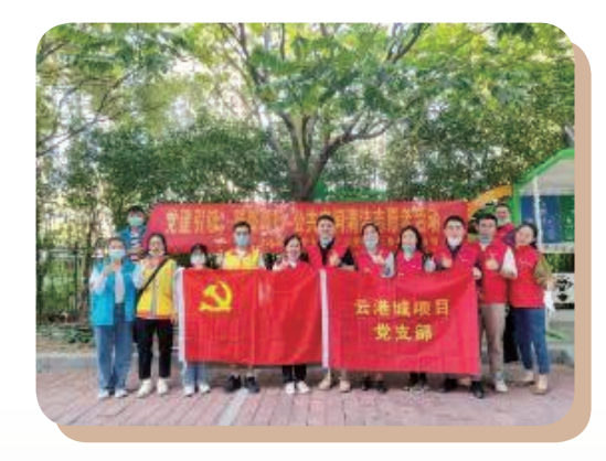
Funding epidemic prevention and control materials

In October 2022, the Guangzhou Yungang City Project and Sanyuanli Street Social Work Service Station jointly launched a public space cleaning volunteer activity. During the activity, our volunteers used brooms, shovels, garbage bags and other tools to pick up white garbage, weeds, decoration waste materials and other wastes on the public platform. They comprehensively cleaned up sanitary blind spots and dead angles.