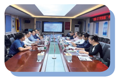
Jiangmen GDH City's application for the "Guangsha Award" was judged on site