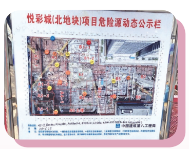
"Red Calibration" On-site Dynamic Management