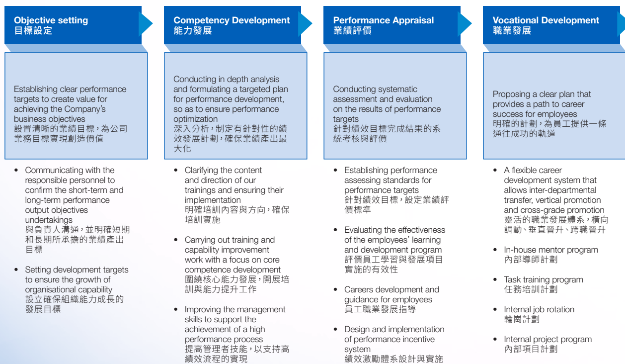
Efficient process for talent development 高效的人才發展流程

本集團嚴格遵守有關禁止童工及強制勞工之有關法律及法規。本集團嚴格禁止僱傭任何16歲以下的員工。本集團人力資源部門與候選人簽署正式僱傭協議前會嚴格執行如核查每個員工的身份證、技能證書及畢業證書等措施，防止任何違規行為。如發現任何年齡、身份及／或就業狀況不合規情況，本集團將立即終止僱傭，並向有關當局報告該事件。在回顧年內，本集團遵守所有與僱傭有關的適用法律和法規。本集團亦採取措施重新確認新招聘員工是否符合徵聘標準。根據政府規定，於試用期內，本集團將支付之每月最低薪金不低於地方政府規定之標準。本集團將根據職位之技能及技術要求釐定員工薪金。